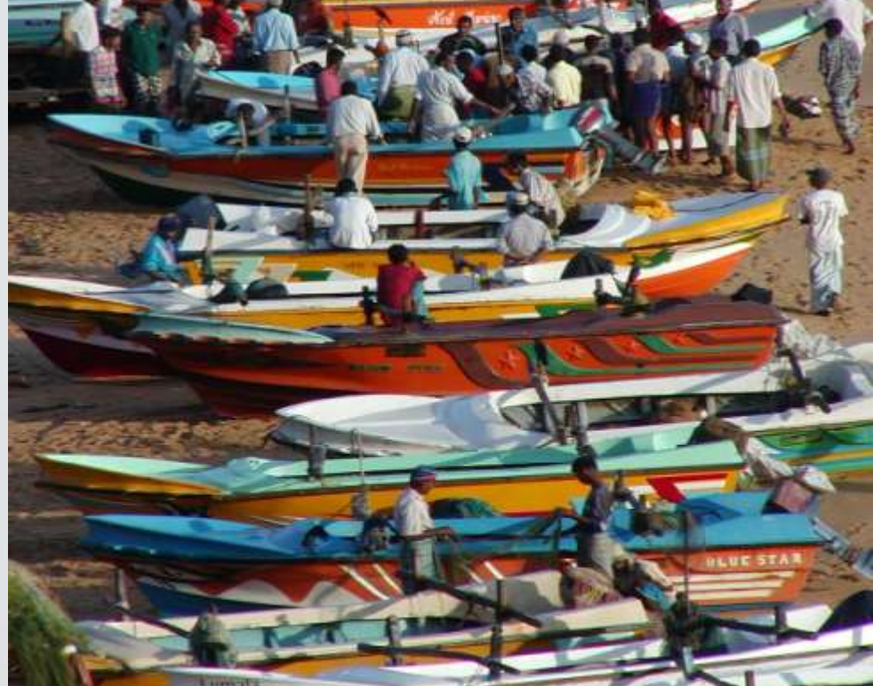
The deep South