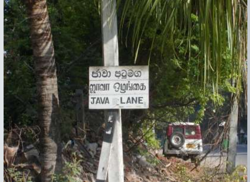
Colombo and Upcountry