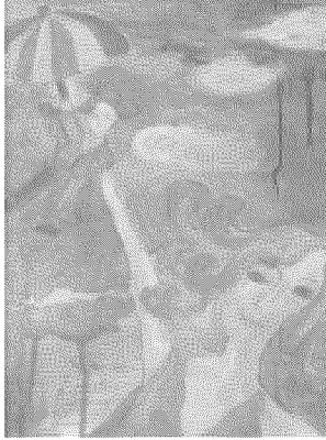
Painting by Cheung SW