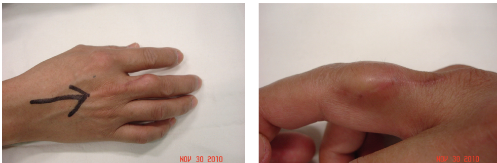
FIGURE 2: Gross picture four months after the injury. There is a mass at the radio-dorsal aspect of the proximal middle phalanx.