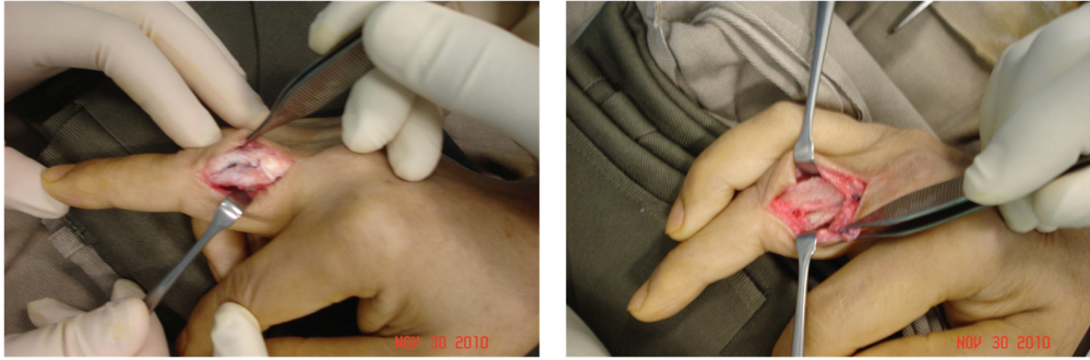
FIGURE 5: Partly calcified bony tissue up to 18 mm × 10 mm × 8 mm adherent to the proximal phalanx of the middle finger that is located underneath the extensor tendon.