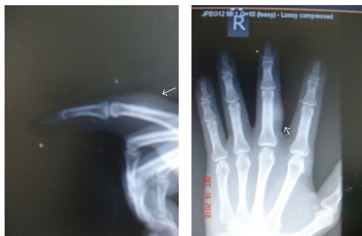
FIGURE 3: Anteroposterior and lateral views of plain radiographs taken eight weeks after injury. There is a calcified bony tissue.