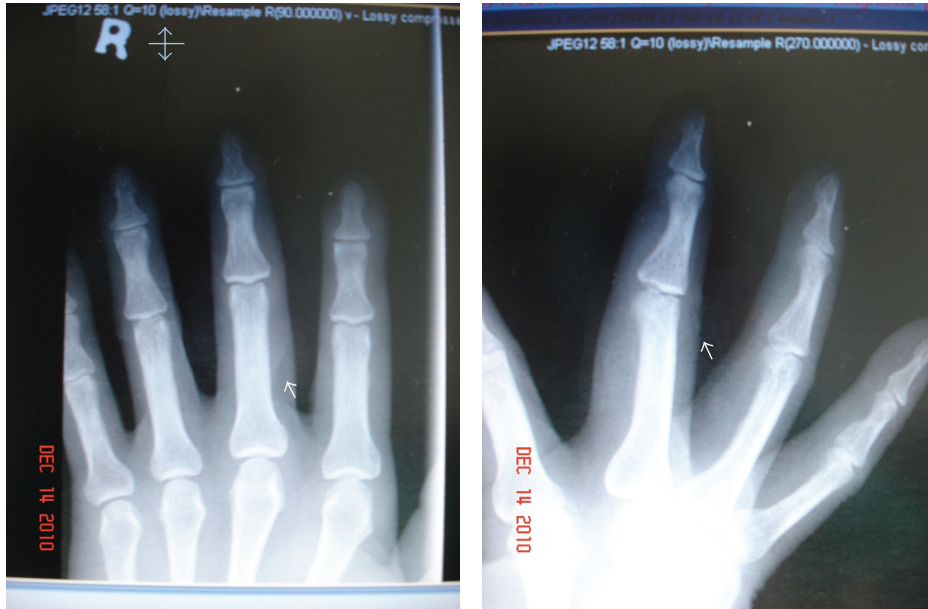
FIGURE 1: Anteroposterior and lateral views of plain radiographs of the hand. There is no evidence of bony irregularity.