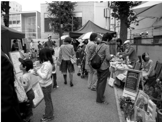
Fig. 13 The small park after reformed