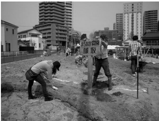
Fig. 10 Works on the community garden

Another reason for the management of the garden being a success is that it provided a chance to gather residents in the field regularly. They have promises with some farmer groups and farmers coming to give agricultural guidance. There is a fresh harvest market every week. However, each group comes to the garden once or twice a month. This is also good for farmers. It does not make them too busy and they can enjoy the occasion. There are some advantages for both of them. For farmers, they can hear the voice of consumers directly and collect their opinions to reflect their new planting; and for the residents, they can get various fresh vegetables and mountain herbs and exchange ideas for cooking (Fig. 10).