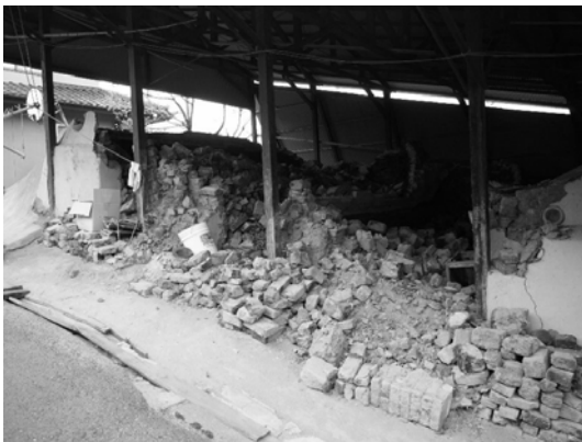
Fig. 4 After the earthquake

This is a good practice of activation of regional history being reviewed through a children's activity. In addition, the case had an unexpected effect. Actually, the kiln was located exactly in the middle of a new planned road which had been in the planning for 25 years and the construction had been finished just a few meters away from the kiln. Finally, the road plan was changed and the kiln is still enjoyed by the community.