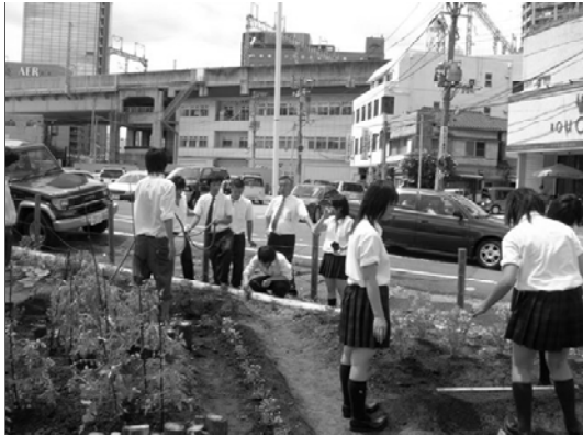
Fig. 7 Students are taking care of plants

because of the colour of the soil until there were more green growth (Fig.7).