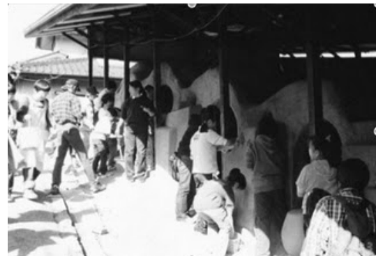
Fig. 2 Refurbishing operation by children

More than ten years after, many children still were coming to visit it until the great earthquake disintegrates it (Fig. 4). However, a few months after the quake, the community re-started to make the repair plan.