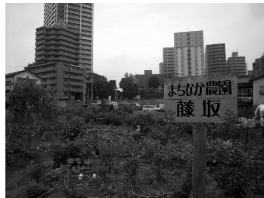
Fig. 11 The garden three months later

necessities. This is one aspect of "child friendly" becoming "elderly friendly" and "human friendly". So far, the garden plays as a very good role in connecting people in the community. Its appearance is very green even though it is at the center of the city (Fig. 11). However, a wide road will be constructed in this place in the future. The community has an agreement with the city. The owner and manager of the site can use the site as a community garden until the construction is started. The relationship between the garden and children might change the appearance of this community in the future.