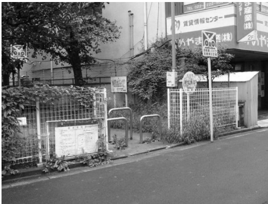
Fig. 12 The small park before reformed

Moreover, a flea market of organic food and hand-made goods opens once in a month and many people gather there (Fig. 13). It succeeded in creating safety and relief in daily life and community activation using the prospective of “child friendly” in city planning.