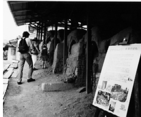
Fig. 1 Kiln before repaired

many children came to visit it during the whole summer. There were many potteries that had been used in old times exhibited inside the old workspace. It was something out of the ordinary and very interesting for children, while nostalgic for their parents and grandparents' generation.