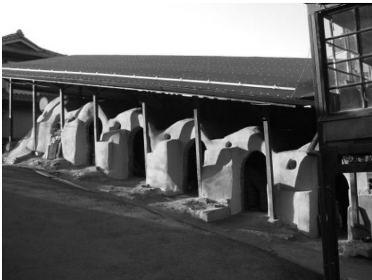
Fig. 3 After repaired