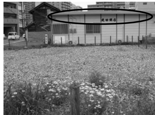
Fig. 6 The community garden before

He and his students decided to carry some soil to the place and planted flowers and vegetables in cooperation with the public office, NPO (non-profit organization), and residents. The reason why they chose farming in the middle of an urban area is because of an idea that farming can involve infants to the elderly, both men and women, and it does not matter whether people have rich experience in agriculture or not. It does not matter whether people have any skills and knowledges or not. They just can work on it. One day, a frame was built on the site and soil was piled up there. Two weeks later, small green buds popped up. Some students planted little flowers surrounding the frame, because they thought that it was infertile