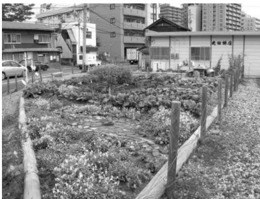
Fig. 8 The community garden six months later

At first, most of the students were too shy to talk to the residents, but they started to talk gradually. Before that, they had no connection with them in their daily life, but they were able to find common subjects to talk about through farming. Usually, students are taught skills from adults, but occasionally students teach the adults. In the second year, the students taught younger children. On a summer evening and a sunny day in autumn, they enjoyed a barbecue party altogether using vegetables from the garden. This community garden became a core to connect the community that seemed to have been interrupted.