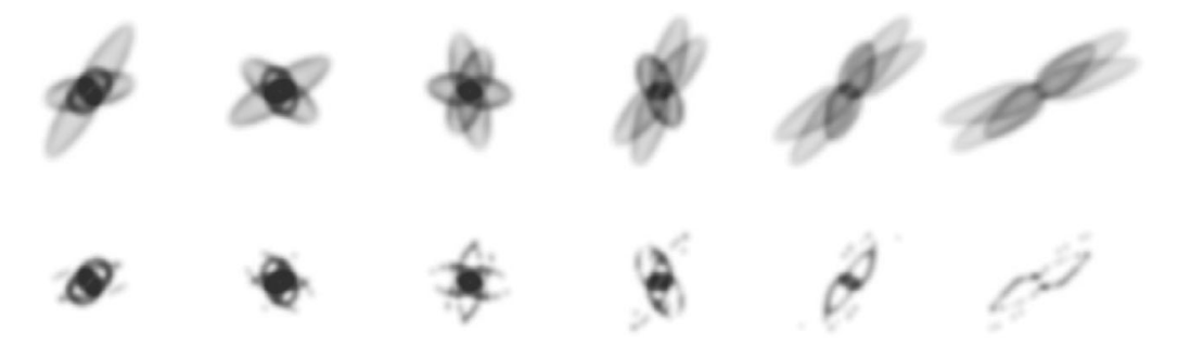
Figure 1. Perception of morphology is affected by viewing angle and sensitivity. Upper row: With the six angles in the model fixed, the viewing angle is changed from each image to the next by 15^{\circ} of i and 15^{\circ} of PA. Lower row: Each image is modified from the one above that the faintest pixels below one-third of the peak brightness are cut off. Brightness levels are shown in linear scale.