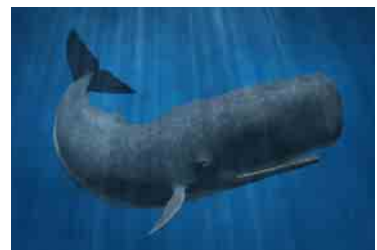
Ambergris, secreted by whales, has been used in perfume for centuries

WASHINGTON – Leading US medical associations have urged fewer tests for patients with mild health conditions and less aggressive treatment for advanced cancers in a bid to cut costs. They say that patients with advanced tumours who showed no benefit from prior treatments should not be given chemotherapy; hi-tech scans for patients with early prostate or breast cancer that appears at low risk of spreading should be avoided; patients’ exposure to radiation should be minimised; ECGs of patients with low risk for heart disease are of no benefit, as are CT and MRI scans for people with low back pain, or for those with fainting symptoms in the absence of signs of seizure or other neurological symptoms; colonoscopies could be done less often in patients who show no signs of disease; and doctors should not prescribe antibiotics for sinus infections unless they last more than seven days. The recommendations are detailed at http://choosingwisely.org . AFP