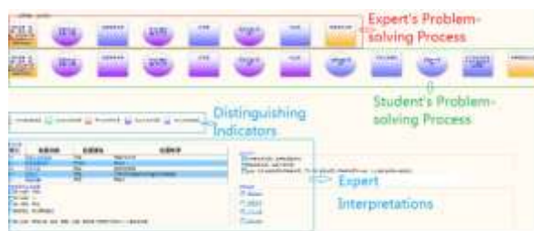
Figure 2. Reflection on problem solving process.

After submitting the diagnostic conclusion, the student can review and reflect on his/her diagnostic process captured by the system in a diagram. The diagnostic diagram includes initial information of the patient, performed examination in a sequence, and clinical judgment after each examination. Once the student's diagnostic process reaches some degree of similarity with that of the expert, the diagnostic diagram of the expert for the same case can be viewed by the student. The differences in the problem solving process between the student and the expert are also highlighted by the learning environment. Further, expert interpretations are provided to help the student to reflect on his reasoning process and underlying knowledge that supports the reasoning process (see Figure 2).