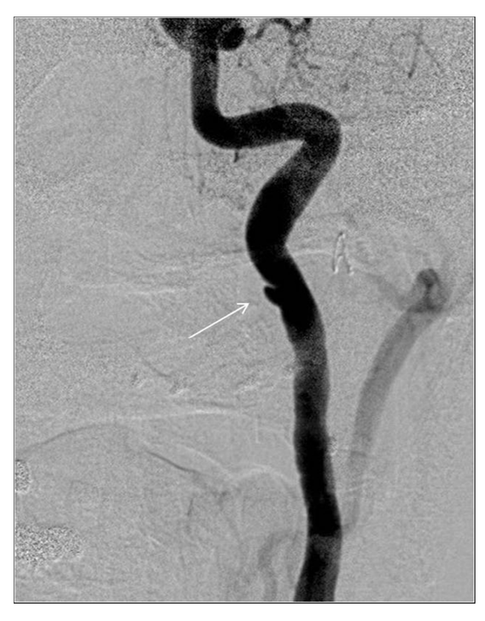
Patient 6. DSA shows a pseudoaneurysm at the right petrous ICA;