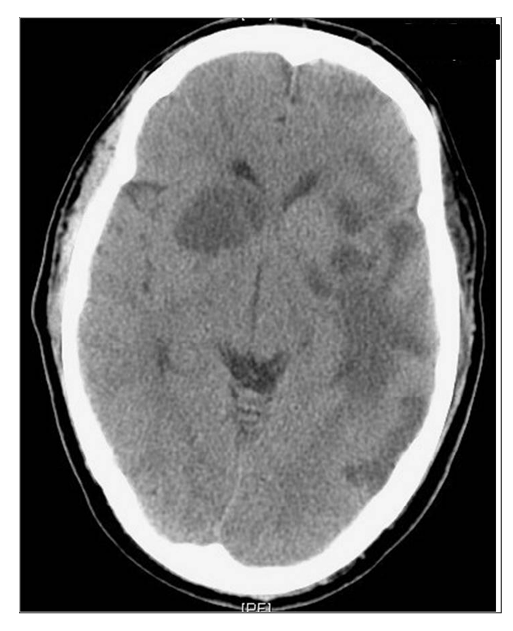
CT brain at day 1 post-operation shows multiple ischemic infarctions. 121x149mm (150 x 150 DPI)