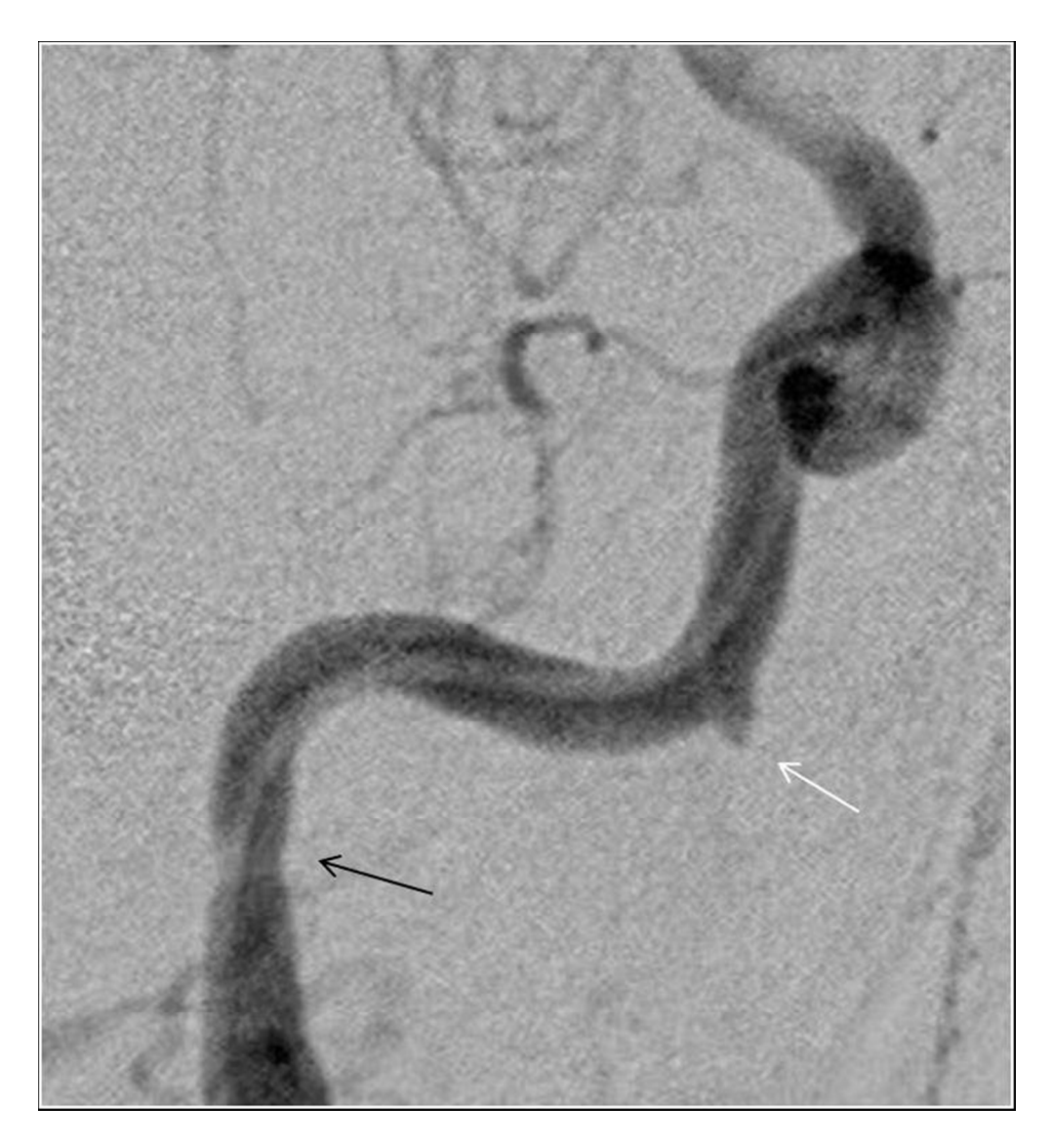
After angioplasty with stenting of the stenotic segment and PED placement 119x130mm (150 x 150 DPI)