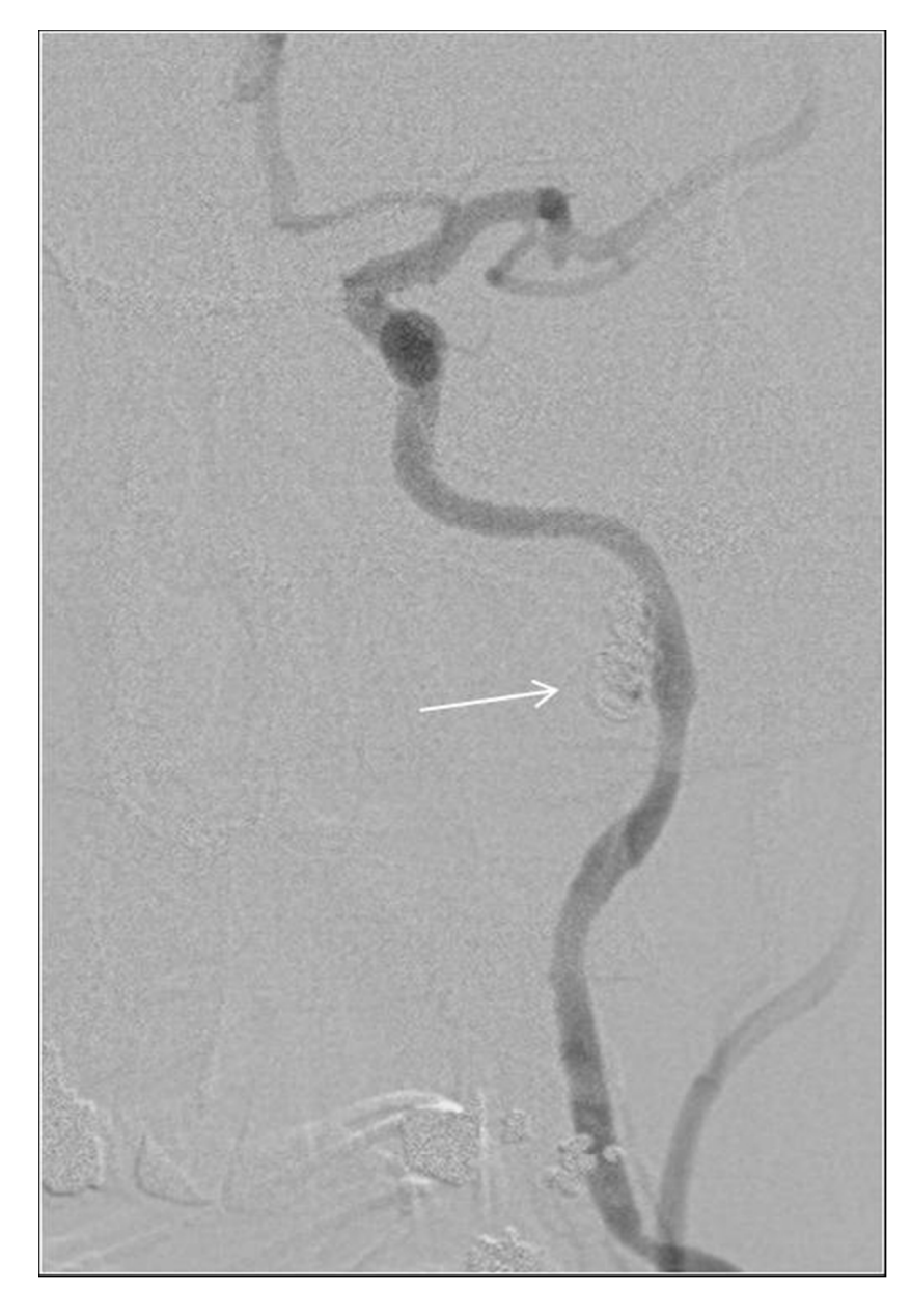
Obliteration of the pseudoaneurysm sac after placement of 2 PEDs and coil 85x125mm (150 x 150 DPI)