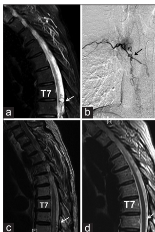
Figure 1: (a) Preoperative T2 magnetic resonance imaging (MRI) of patient 1 showing the serpiginous veins surrounding the thoracic spinal cord most prominent at T7/8 level (arrowed), secondary to the dural arteriovenous fistula (DAVF). (b) Preoperative super-selective angiography of patient 1 showing the DAVF fed by the right T7 radicular artery (arrowed). (c) Preoperative T2 MRI of patient 2 showing the serpiginous veins surrounding the thoracic spinal cord most prominent at T8/9 level (arrowed), secondary to the DAVF. (d) Postoperative T2 MRI of patient 1 showing the resolution of venous engorgement around the thoracic spinal cord (arrowed)

The available therapeutic options include endovascular embolization and microsurgical ligation. The former, while avoiding the risks of open surgery, has been found to carry high recurrence rates that range from 40% to 70%. This was particularly evident in early reports of that used polyvinyl alcohol, although more recent series using liquid embolic agents have shown improved success rates.