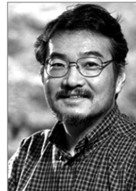
Masashi Yanagisawa, M.D. Ph.D. Honorary Guest Editor