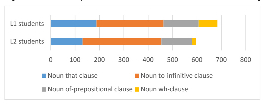
Figure 1 Variation of syntactic structures across L1 and L2 students' writing

As was introduced in Section 2, in the Noun Complement construction a stance head noun takes a nominal complement either in the form of that clause, to-infinitive , of-prepositional or preposition plus wh- clause, but the frequencies of these complement structures differ across L1 and L2 students' writing, as is shown in Figure 1. These two groups of students make similarly frequent use of to-infinitive and of-prepositional structures but both that clause and preposition plus wh- clause are found significantly less frequent in L2 students' texts. There are 188 cases of that clause and 77 cases of preposition plus wh- clause in L1 students' writing with only 130 cases of that clause and 16 cases of preposition plus wh- clause in L2 learners' writing (LL = 11.89, p < 0.01; LL = 44.82, p < 0.01).