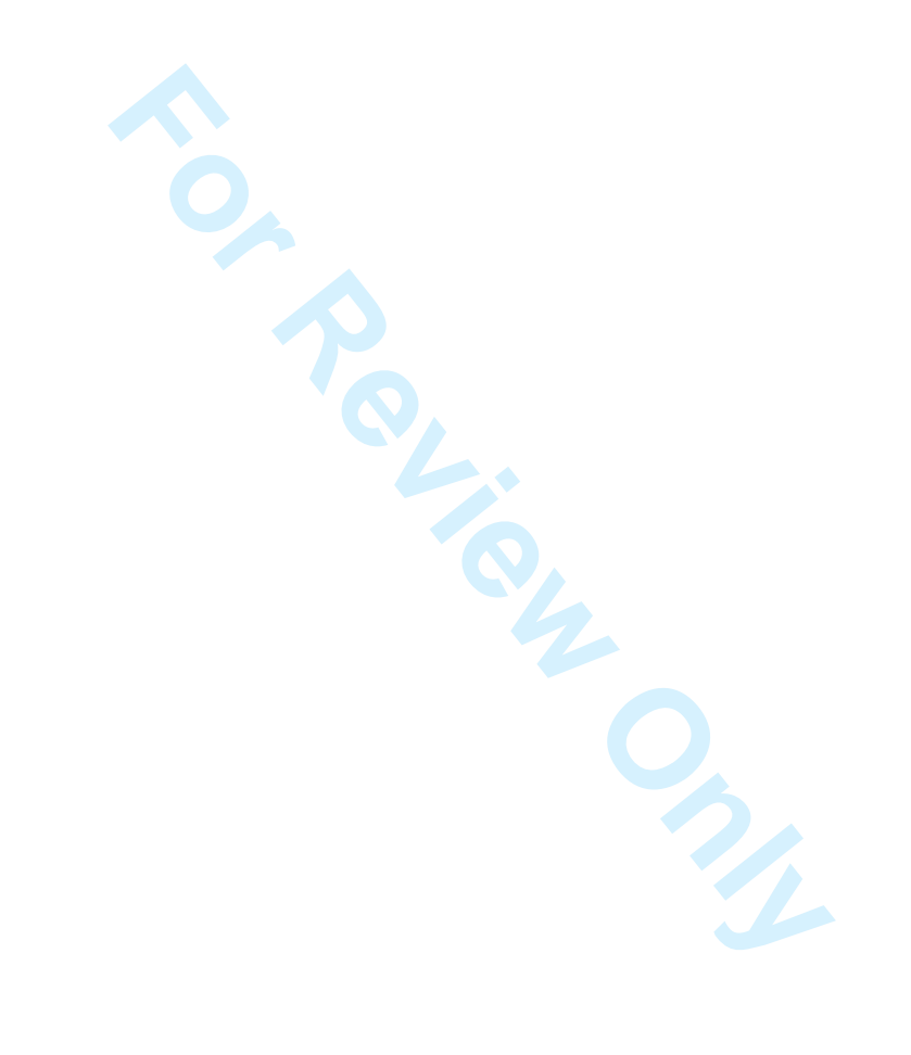
Fig. 1 Tooth loss (n = 229) according to tooth type.