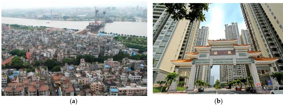
Figure 1. Before and After Redevelopment in Liede Village. (a) the drastic change before the regeneration, (b) the drastic change after the regeneration

In particular, the original rural residents were given a generous compensation package, including the right to be rehoused back to the new project with an option to purchase extra flats based on some pre-determined criteria at a discounted price level. Some households were reported to have obtained more than 10 new flats, with the highest standing at 20 new flats! Given the proximity of the site to the CBD in Guangzhou, the housing price has gone up by at least 5 times since redevelopment, which helps the rural residents to quickly accumulate wealth afterwards. To make the redevelopment outcome more sustainable, part of the site has been turned into commercial development, including offices and hotels, and leased to the private sector. This part is still collectively owned by all rural residents for long-term sustainable incomes. In recent years, each household has been paid on average about 60,000 Yuan per year, which is almost as much as an average university graduate can expect as a starting salary in Guangzhou.