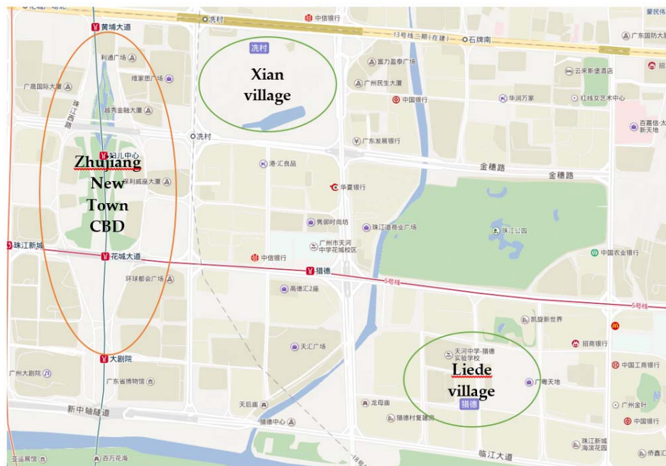
Figure 2. Location Map of Xian Village and Liede Village. CBD, central business district.