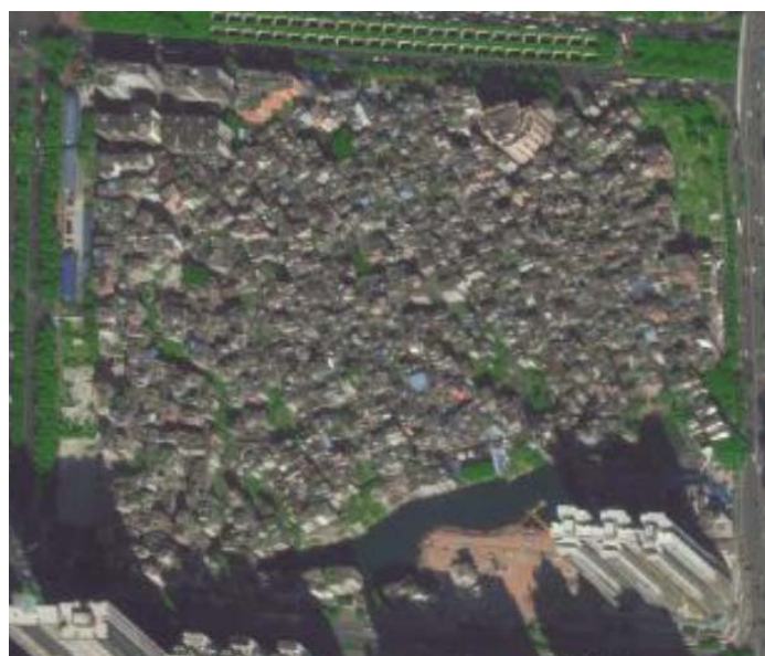
Figure 4. Current State of Xian Village (three blocks of rehousing buildings in the right bottom corner).