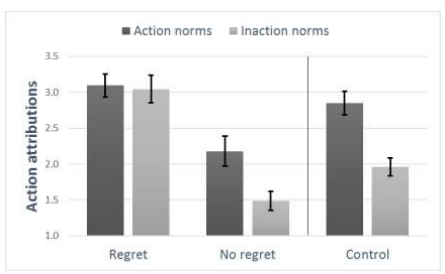
Figure 2. Experiment 2 action-inaction attributions (first row), perceived action-inaction norms (second row), and the regret-norm interaction (third row). Higher scores indicate higher attributions of action over inaction. The interaction plot combines data of the before-after conditions with norms split using median (2.00) on a 0-5 norms scale, to mirror the reporting contrasts in Experiment 1 and Figure 1. Error bars indicate standard error.