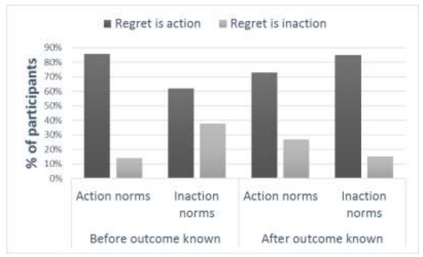
Figure 3. Experiment 3 plots of the action-inaction attributions (first plot), perceived action-inaction norms (second plot), and the regret-norm interaction (third plot). On all plots, scores indicate the percent of participants who chose that answer on dichotomous choice between action and inaction. Error bars indicate standard error.