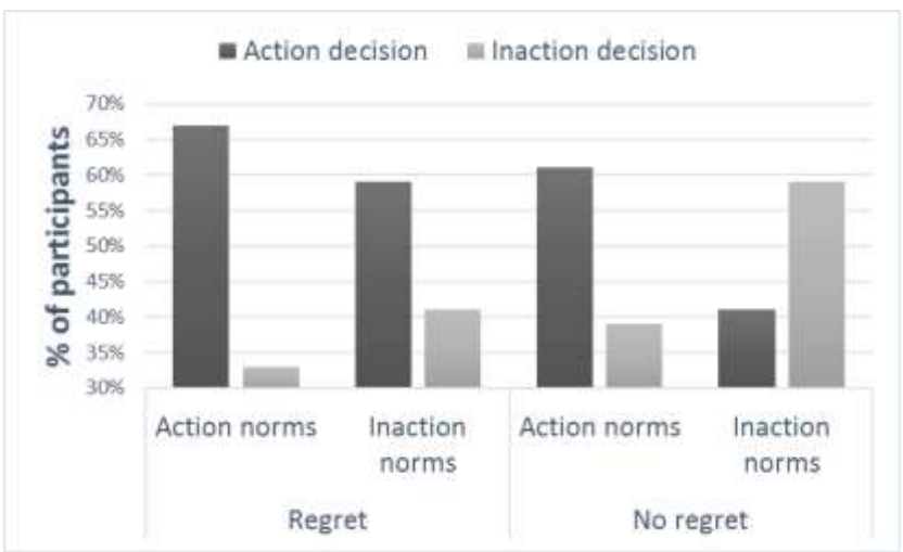
Figure 4. Experiment 4 plots of the action-inaction attributions (first plot), perceived action-inaction norms (second plot), and the regret-norm interaction for the whole sample (third plot). On all plots, scores indicate the percent of participants who chose that answer on dichotomous choice between action and inaction. Error bars indicate standard error.