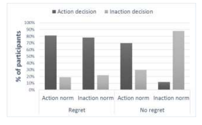
Figure 1. Experiment 1 action-inaction attributions (first plot), perceived action-inaction norms (second plot), and the regret-norm interaction (third plot). Scores indicate the percent of participants who chose that answer on dichotomous choice between action and inaction. Error bars indicate standard error.