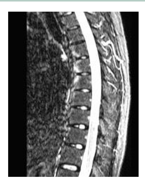
Figure 1. Corner inflammatory lesions.

3500/80 ms, inversion delay being 140-160 ms; matrix size, 248 \times 200 . Twenty-four slices were obtained and the total scan time was 5 min 7 s.