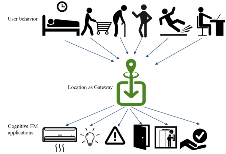
Figure 3. The gateway between user behavior to cognitive FM applications

After collecting user behavior data, a gateway is required to integrate such data into the cognitive FM system for further FM application processing and actuating (Chen et al., 2015). Location is argued in this paper as the gateway. With every facility and sub-facility having their location, the location of users can be attached to the facility as a gateway to link the users and the facilities. In the cognitive FM system, the location of sub-facilities serves as the reference system of applications for users. That is to say, given every facility has its coordinate information in the cognitive FM system, once users' locations are tracked, the relative position of users to the facilities is determined. The coordinate information of facilities could be marked and stored in a facility information model. The coordinate information of users collected by the UWB LPS can be registered and computed in the coordinate system of the facilities by coordinate transformation (Tiemann et al., 2015). The transformation of a triplet coordinate in the UWB LPS to the facility coordinate system is shown in Equations (1) to (6). Thus, the indoor positioning information of users will be integrated into the cognitive FM system with the facility coordinaKANGte system as a reference system. Similarly, the facility coordinate system can also be transformed to the universal coordinate system to link up with GPS (Global Positioning System) to ensure the seamless connection between the LPS with GPS.