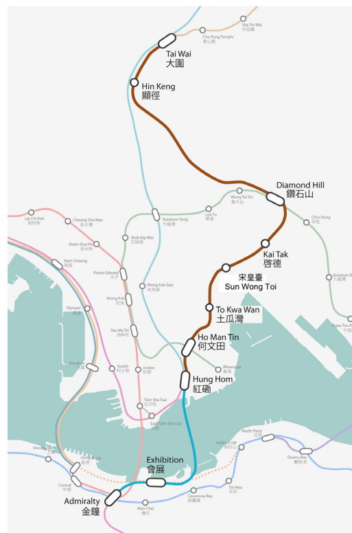
Figure 1 The new metro line from Tai Wai to Hung Hom stations. The line will open in two phases: the first phase was in February 2020 with four stations opened (Tai Wai, Hin Keng, Diamond Hill and Kai Tak); the second phase will be in 2021 (including Sun Wong Toi, To Kwa Wan, Ho Man Tin and Hung Hom stations). The map was adapted under free art licence from Wikimedia. Retrieved from https://commons.wikimedia.org/wiki/File:SCL_ga_map.png .

We will also conduct a longitudinal study of another two lines that entered into operation recently. Sites were selected from sections between Sheung Wan and Kennedy Town stations of the Island Line (opened in March 2015, group 1-E) and from Admiralty to South Horizons stations