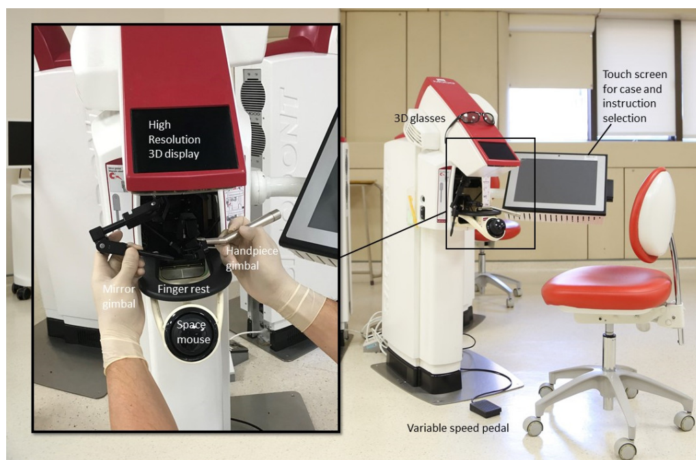
Figure 1. Components of Simodont.

the Simodont dental trainer and DentSim. These simulators utilize computer-assisted simulation, which connects computer learning software to a simulator. The simulator generates 3D images for students to operate on using dental handpieces. The results are sent to the computer for evaluation and feedback [4]. Students can practice on these devices before practicing on phantom heads and, eventually, on real patients. The Simodont dental trainer (MOOG, Nieuw Vennep, The Netherlands) is one such simulator. The Simodont brand is developed by Nissin Dental Products Europe BV (Nieuw-Vennep, The Netherlands). The various components of Simodont Dental Trainer are shown in Figure 1.