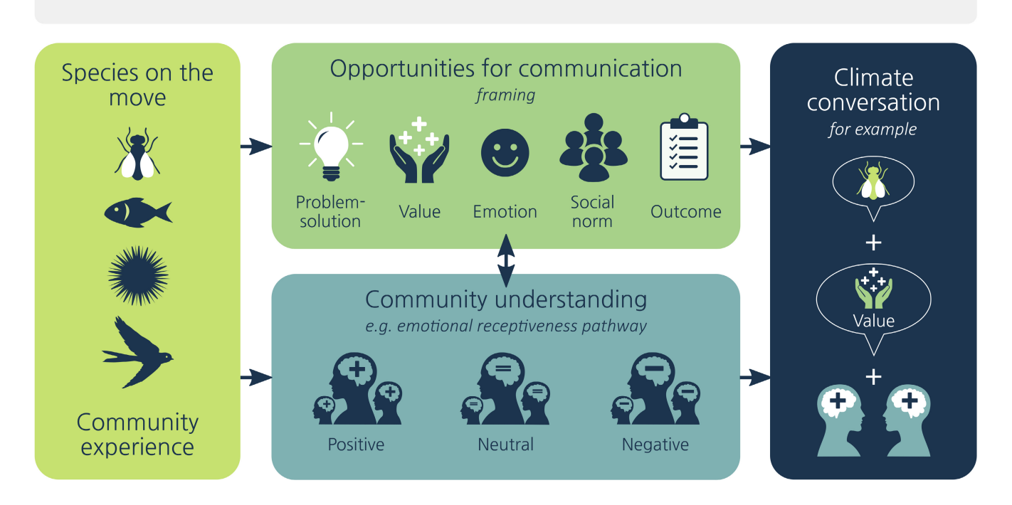
FIGURE 1 Climate-driven changes in species distributions represent opportunities for communication on climate change using frames that connect to a range of human values and emotions.

motivate action outside of a more political climate change framing (Lucas & Davison, 2019). In addition, species-on-the-move often occur at a scale likely to generate local interest—and at a scale where investment in adaptation is practical—without creating the sense of hopelessness and helplessness that comes with a focus on global-scale impacts. Moreover, climate communication is most effective for engendering individual agency and action when aimed at smaller audiences (i.e. 10,000 people or less), and so locally relevant species-on-the-move are ideally suited to this scale of engagement (Bhowmik et al., 2020).