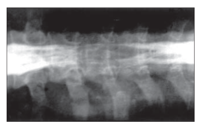
Fig 1. Myelogram film of case 1 (anteroposterior view)