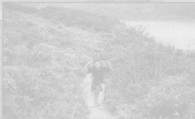
Beautiful sunshine, fresh air, green vegetation and calm water... What a marvelous trip!