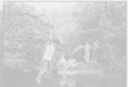
Rope-river-crossing: "I am falling..."