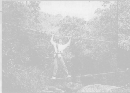
Participants had to complete this challenging task — crossing the river with 2 ropes only.

“Why — Why — Why! ... Ask it of everything your mind touches, and let your mind touch everything!” ~ Ann FAIRBAIRN