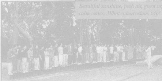
Oldest to the left, youngest to the right, line up!

“Why — Why — Why! ... Ask it of everything your mind touches, and let your mind touch everything!” ~ Ann FAIRBAIRN