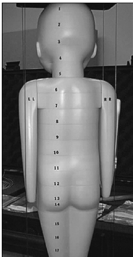
Fig. 1. Standard anthropomorphic phantom representing a 5-year-old child.

evaluated organ-specific doses and cancer risks, bearing in mind its implications on radiation protection.