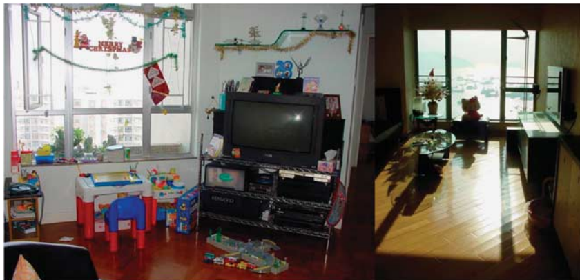
Figure 5: Good views are important for daily living activities in the living room.

considered a better living environment by the general public (Figure 5). However, there has been little discussion on the view criteria or their true meaning.