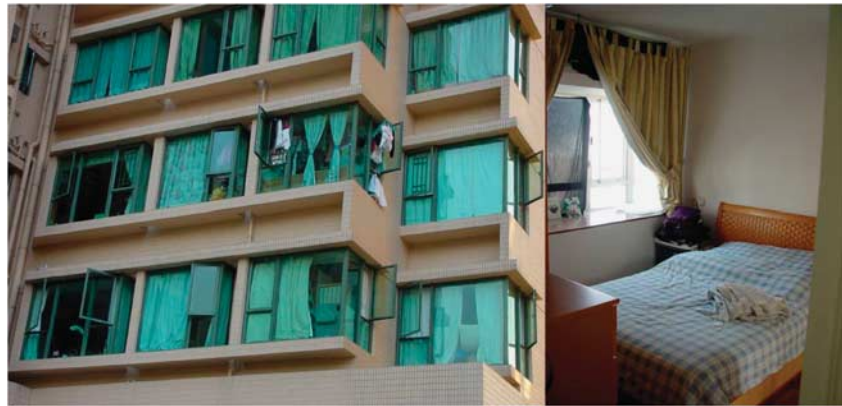
Figure 6: Frequently used curtain on bedroom windows for privacy (left: from outside; right: from inside).

it is justified to reduce the window size in a privacy-sensitive situation in order to avoid invasions of privacy.