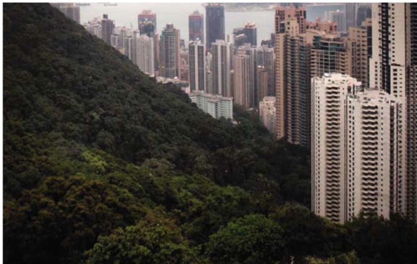
Figure 1: The compact residential environment on the limited buildable land in Hong Kong.

The urban character of Hong Kong favors vertical expansion of the city, resulting in a compact urban environment where living, working and leisure happen in a mixed and combined mode. The urban form takes the shape of urban canyons where living spaces at the lower portion of skyscraper apartment buildings are often deprived of daylight, natural ventilation and views. Therefore, window design is usually assumed to be a challenging issue. To tackle this problem, authorities of the Hong Kong government have adopted a series of design regulations based on daylighting performance in residential window design.