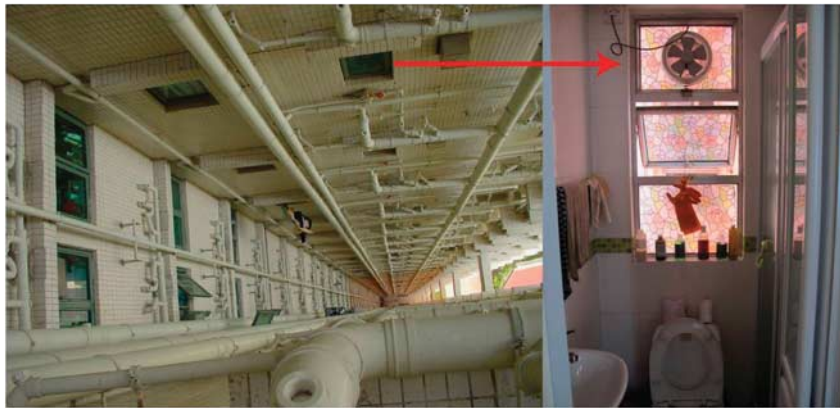
Figure 4: Toilet windows usually face the re-entrant, where the bacteria easily spread through stack effect.