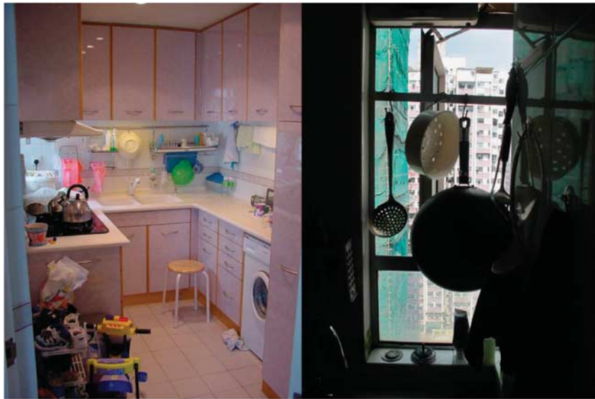
Figure 3: Left: young couples usually choose to dine out and the kitchen is used for storage function; right: occupants hang utensils on kitchen windows, and do not care about daylighting performance in kitchen.