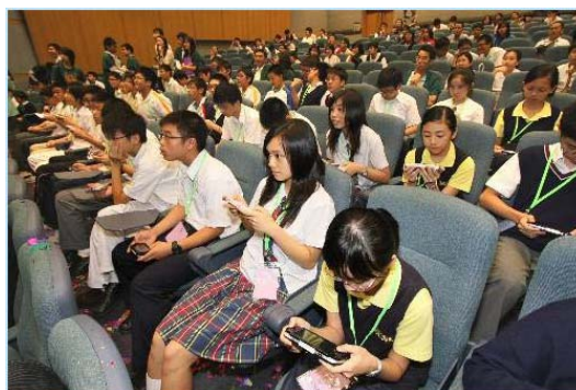
Figure 2: Students from 18 schools are using our mobile quiz platform in a local school contest

To demonstrate the feasibility of our proposal on different platforms, we used the Java 2 Micro Edition (J2ME) technology to build our mobile quiz system containing various game rooms running on a Mac server that can be accessed through any J2ME-enabled 3G mobile phones. We spent around 4 man-months to complete the implementation and testing of our mobile quiz system. A project website [2] was set up to allow the downloading of a client program (.jar) for installation on any mobile devices to access our mobile quiz system as shown in the picture below.