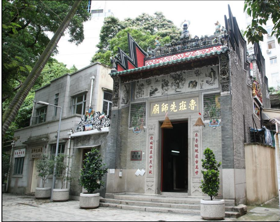
Figure 7. Lu Pan Temple, which has benefitted from the “Financial Assistance for Maintenance Scheme” for its repair work.