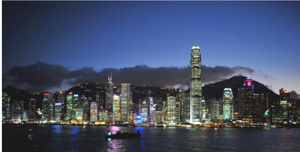
Figure 1. Hong Kong's "harbourscape."

Yet, Hong Kong is more than its harbour and more than a sea of high rises. Hong Kong's main island, what is properly called Hong Kong Island, is one of some 200 islands and one of three distinct parts of the Hong Kong Special Administrative Region.