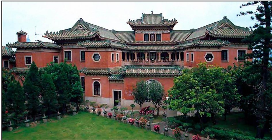
Figure 6. King Yin Lei.

planning process. Clearly, such economic incentives can only be used sparingly – and strategically.