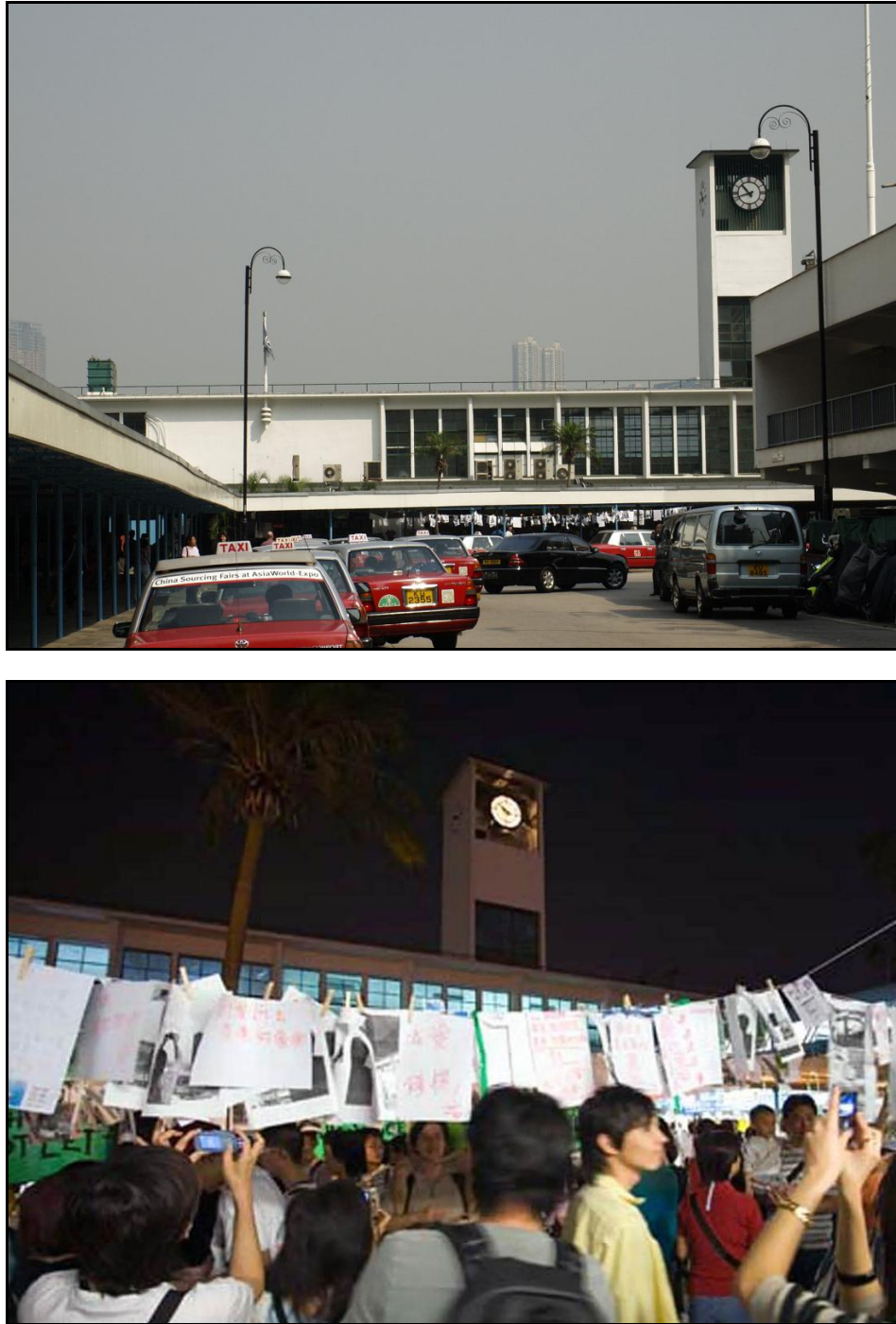
Figure 2. The Central Star Ferry Pier (top) and the public protest (bottom).

These two piers were slated for demolition in order to allow the government to reclaim a portion of the harbour to put in a trunk road to ease traffic congestion. It was for numerous reasons that the public responded so strongly to this proposed demolition, however, it largely came down to their attachment to