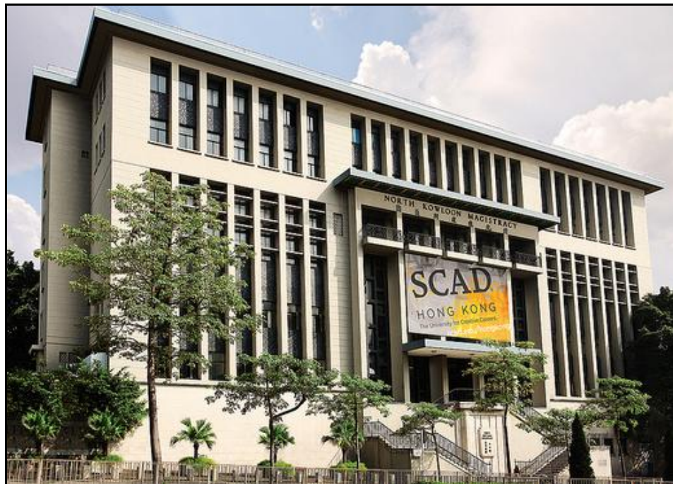
Figure 5. The former North Kowloon Magistracy was revitalized as an art college. In 2011, the project received a UNESCO Asia-Pacific Award for Culture Heritage Conservation in recognition of its successful adaptive reuse for the greater Hong Kong community.

government, but could be put to new uses by qualified non-profits. These buildings and sites are intended to provide services or business in the form of social enterprise with an emphasis on community benefit. Now in its third batch, the “Revitalising Historic Buildings Through Partnership Scheme” has so far seen nine buildings and sites awarded and undergoing careful adaptive reuse. More importantly, in terms of development objectives, these properties have been (or will be) important trigger points for carefully-paced development at the district level ( Figure 5 ).