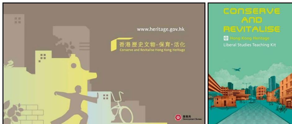
Figure 4. Public Awareness Campaign on Heritage Conservation (top) and Liberal Studies Teaching Kit on Heritage Conservation (bottom).

Some two years later, the bureau was in the position to work with the Hong Kong Institute of Education in creating an in-depth teaching kit for Hong Kong's newly reformed curriculum (the "New Curriculum") for upper level (secondary school) students. Not surprisingly, the multi-unit kit includes in-depth material on revitalization and its relevance for Hong Kong people.