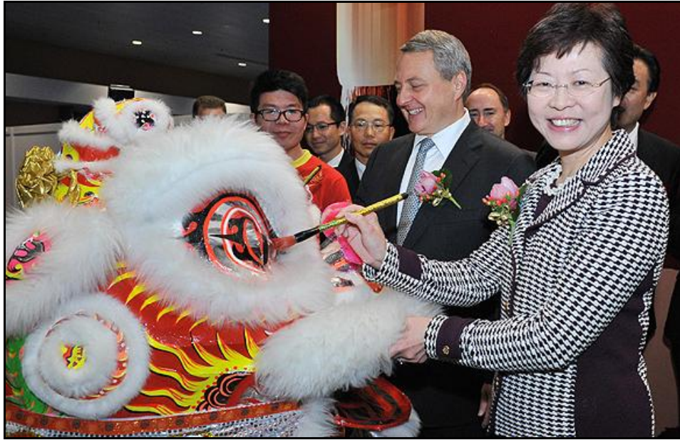
Figure 3. Secretary for Development, Mrs. Carrie Lam.

In 2008, within the Development Bureau, the Commissioner for Heritage’s Office (CHO) was set up to support bureau programmes related to heritage conservation. The specific tasks of this office are “to provide dedicated support to [the] Secretary for Development in implementing the policy on heritage conservation and keeping it under constant review, taking forward a series of new initiatives as announced in the Chief Executive’s Policy Address..., as well as serving as a focal point of contact, both locally and overseas.”