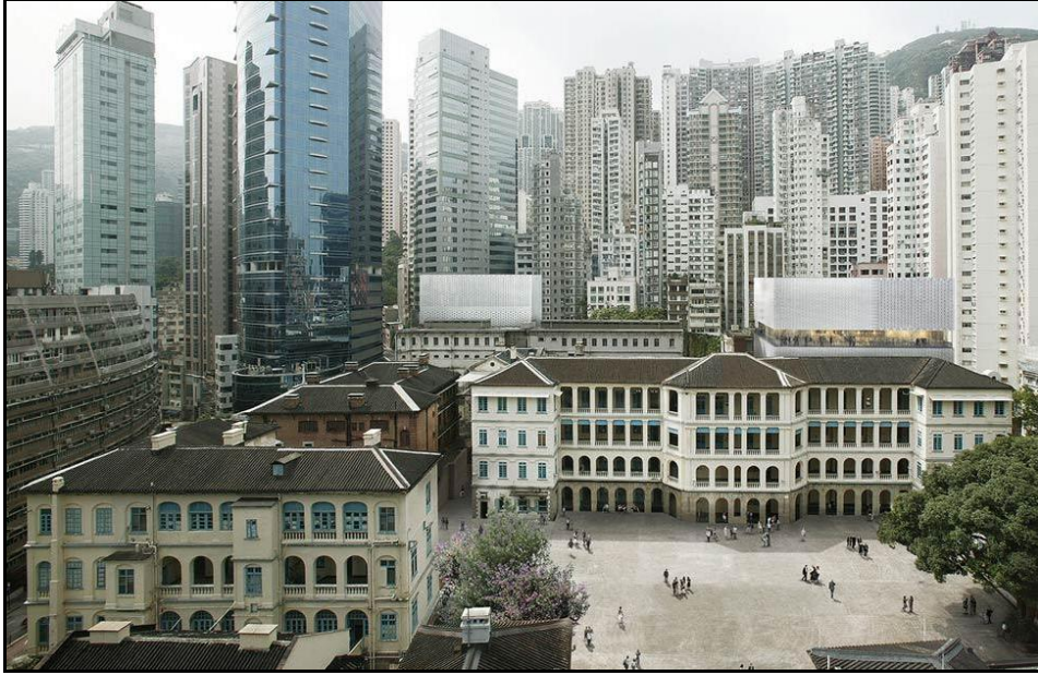
Figure 9. Central Police Station Compound, one of the heritage building clusters in “Conserving Central.”