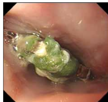
FIG 2. Endoscopic view of the coin, 18 cm from the incisor