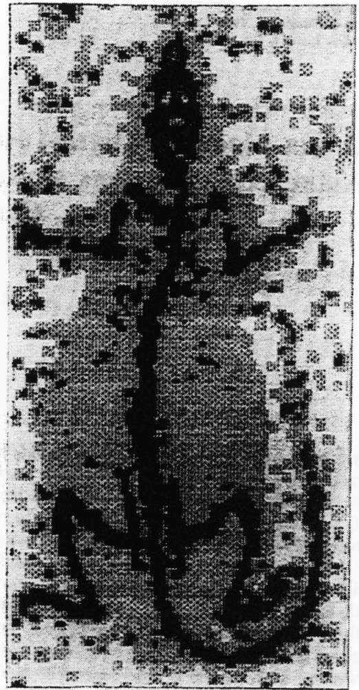
FIG. 1. Bone scan of the rat as determined by dual energy X-ray absorptiometry.

Rat femur was snap frozen in liquid nitrogen and RNA was extracted with guanidinium thiocyanate immediately after the muscle and periosteum were removed. The single step acid guanidinium-phenol-chloroform method was used to isolate the total cellular RNA (15). An oligonucleotide (5'-AGAGA-