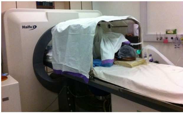
Fig. 1 After general anesthesia, patient on the platform was put in the right lateral position. The transducer below the platform targeted the liver lesion through the rib spaces