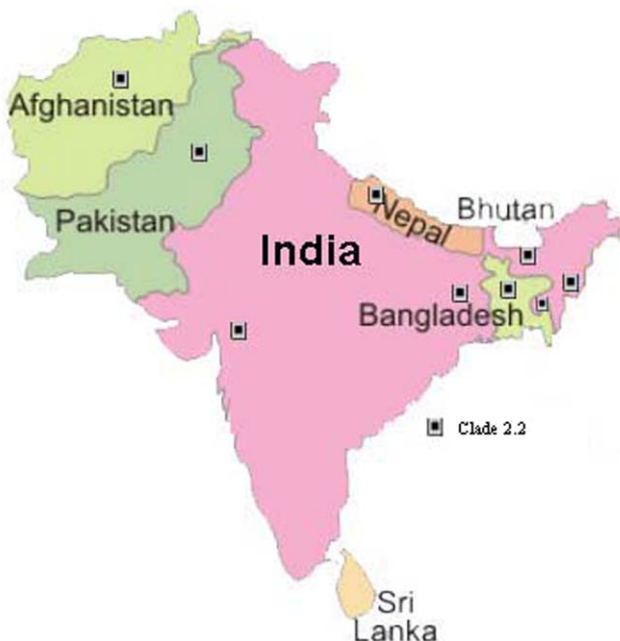
Figure 4. Circulation of H5N1 viruses in South Asia till 2009. doi:10.1371/journal.pone.0031844.g004

Sequencing of complete genome (all 8 segments) of 7 H5N1 viruses isolated from various sample types in both the outbreaks (one viral allantoic fluid of duck origin, 1 virus from duck carcass, 3 from chicken carcass and 1 each from cloacal and tracheal swab pools) was carried out. RT-PCR for amplification of various gene fragments with overlapping segment-specific primers was carried out using Platinum Taq High Fidelity (Invitrogen, USA) as described previously [12]. The PCR products were gel purified using QIAquick gel extraction kit (Qiagen, Germany) and sequenced using specific PCR primers with BigDye® Terminator v3.1 Cycle Sequencing Kit (Cat. 4337455, Applied Biosystems, USA) in 3130- Genetic Analyzer (Applied Biosystems, USA). Nucleotide sequences reported in this study have been submitted to the GenBank (accession numbers CY089410-CY089425, CY089468- CY089477,