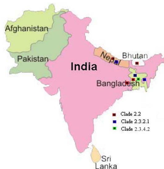
Figure 5. Circulation of H5N1 viruses in South Asia since 2010. doi:10.1371/journal.pone.0031844.g005