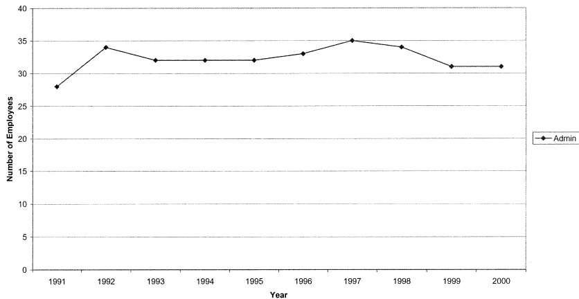
Figure 2: Number of Civil Servants Employed by Bureau 1 of District Government in City “A,” 1991–2000