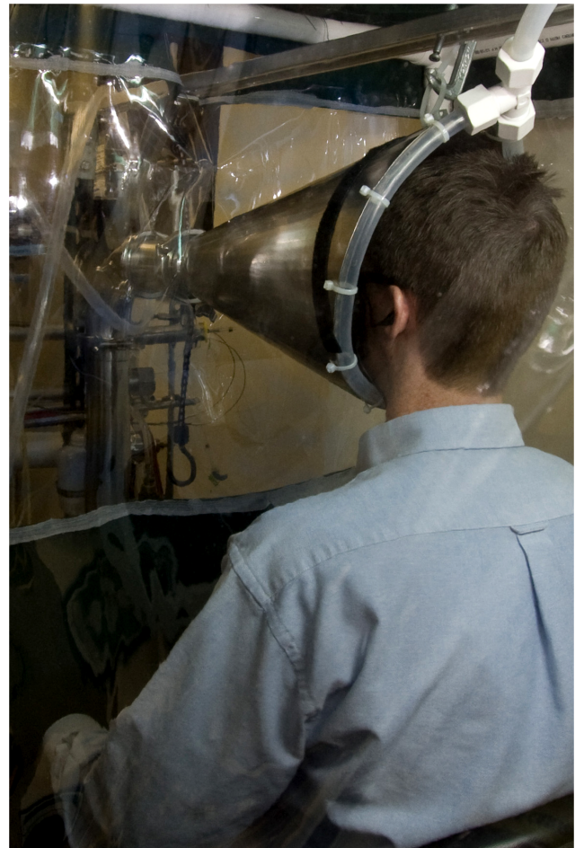
Figure 2. Exhaled breath collection system. Each volunteer sat as shown with face inside the inlet cone of the human exhaled breath air sampler inside a booth supplied with HEPA filtered, humidified air for 30 min while wearing an ear-loop surgical mask. Three times during the 30 min each subject was asked to cough 10 times. After investigators changed the collection media, the volunteer sat in the cone again, without wearing a surgical mask, for another 30 min with coughing as before.

RNA extraction in Trizol-chloroform, reverse transcription, and quantitative PCR were performed as previously described [1,32]. Quantitative PCR was performed using an Applied Biosystems Prism 7300 detection system (Foster City, CA) for coarse fraction samples or a LightCycler 480 (Roche, Indianapolis, IN) for the fine particle fraction. Duplicate samples were analyzed using influenza A and B primers described by van Elden et al. [33] A standard curve was constructed in each assay with cDNA extracted from a stock of influenza A (A/Puerto Rico/8/1934, Advanced Biotechnologies Incorporated, Columbia, MD) with a concentration of