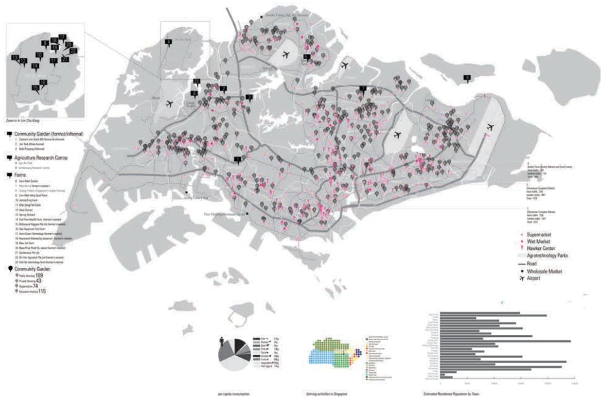
Figure 2: Food networks and nodes of Singapore

With records of inhabitation tracing back to the 2 nd century AD, Singapore has a long history as a port of trade as well as a producer of agricultural products, from rubber and gambier to nutmeg, pepper, tropical fruit and orchids. As the population of Singapore grew throughout the 19 th and 20 th century, agricultural production was pushed out to the city center in the south part of the island to the northern hinterlands (Hee 2005, 53). As recently as the 1960’s, Singapore had over 20,000 subsistence-type farms on over 14,000ha of land. In the 1970’s many farmers were relocated for water catchment projects and agricultural production was centralized into larger commercial farms where intensive production technologies enabled Singapore to produce of 80% of the poultry, 100% of the eggs and 100% of the pork required to feed the approximately 2.3 million people which resided in Singapore in 1975. The 1980’s saw a further reduction in the amount of agricultural land due to the building of housing and industrial estates, with approximately 2000 farms occupying approximately 2000 ha of land. At that time the Primary Production Department (the pre-cursor to the AVA) began the development of agrotechnology parks in order to maximize productivity of farmland, phased out pig farms due to environmental pollution, and increasingly focused efforts on the introduction of high-tech, intensive farming practices and methods. (Ava.gov.sg n.d.; En.wikipedia.org n.d.).