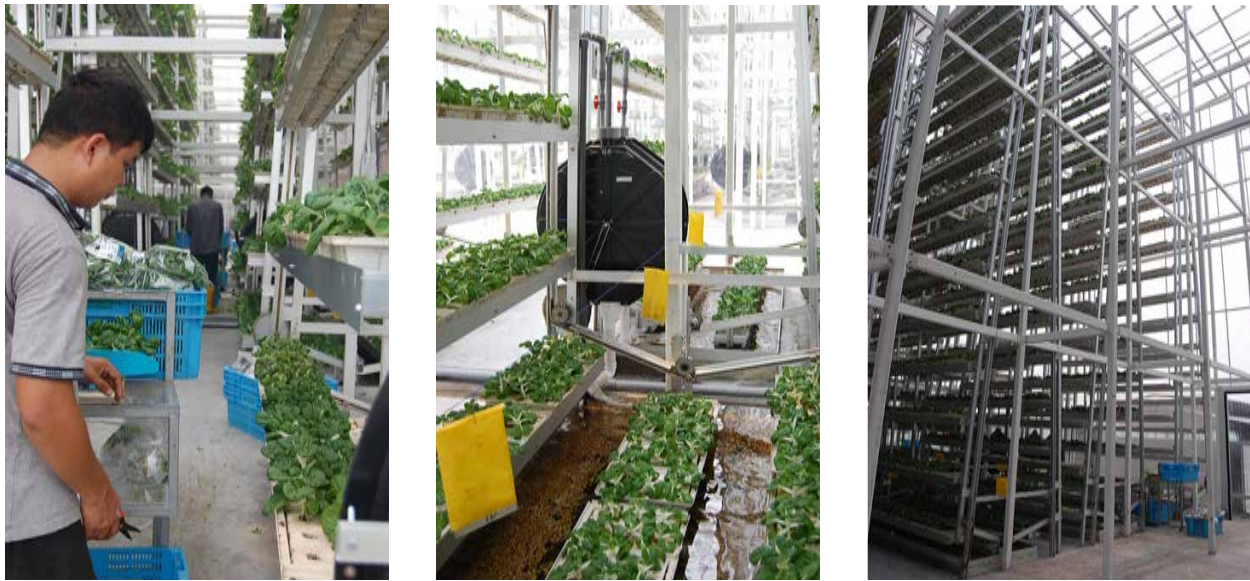
Figure 6: Sky Greens prototype From left: harvesting, water and tray system, A-frame structure

commodity trade. The benefits of local produce, particularly if it is organically grown, include lessening the ecological food print of the city - less travel time, less fossil fuels. Another benefit is knowing where your food comes from, how it is grown and who has grown it. This is an invaluable lesson for both children and adults and leads to the support of another food security principle, that of food utilization. The supply of fresher food that has more nutrients and where one is aware of the inputs and outputs of its growing process leads to a safer and more nutritious diet. Although food grown by individuals cannot completely allow Singapore to become food self sufficient, it is these developing networks that hold the potential for food as a commons to take hold in Singapore. Rather than focusing solely on the development of proprietary technological solutions to intensifying local food production, formal financial support should be given to educating the public about the benefits of producing and buying local food, rather than contributing to people increasingly valuing internationally sourced produce. Although the expansion of community gardens is one solution to increasing local food production, a recent project has combined both technology and intensification: the Sky Greens urban vertical farm.