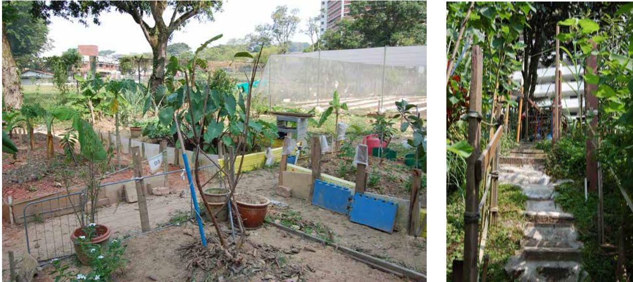
Figure 5: Formal community garden in Jin Tech Whye (left) and informal community garden in Clementi

government should also look for ideas on how to increase local food production. If food is to ever be understood as part of the commons in Singapore, the value of a community spirit and support of local industries needs to be developed in order for food to become accessible and available for all, in particular for the 20% of the population who live at or below a social inclusion level of income (Loh 2011, 90). Those who can afford to pay for local food need to be educated about the value of supporting urban agriculture, for health, safety, taste and for the creation of community. And for those that do not have economic or physical access to food, other options are needed so they can produce their own food, such as community gardens. It is only then that Singapore can become more self-sufficient in its food supply.