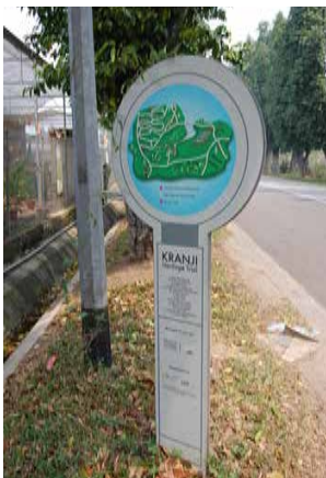
Figure 4: Argotourism trail: Kranji countryside

Although farms can apply for money from the $10 million AVA-administered Food Fund to improve productivity on existing farms or to develop new technology, local farmers who are part of the Kranji Countryside Association (KCA), one of only a few farmer’s organizations in Singapore, cite several hurdles to opening or expanding agricultural operations to produce food. These hurdles include: relatively short-term leases (20 years, with 3 year extensions) which make it difficult to invest in technology, improvements and training; higher prices for ornamental plants and fish for export, leading many farms to turn away from food production; and a lack of awareness on the part of the public as to the benefits of local food, and therefore consumer unwillingness to pay more for local produce rather than produce imported from China or Malaysia (Tobias 2011). These issues need to be addressed in order for a local network of commercial food production to flourish in Singapore.