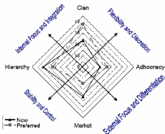
Figure 2: Organizational Culture Profile of the Institution

This is reflecting that employees of the institution, in general, prefer to have larger flexibilities, freedom, be innovative and willing to take risks. They value opportunities for new things. They consider the organization as too results oriented or achievement oriented. People are too competitive, too aggressive, too hard-driving, high demands and achievement oriented.