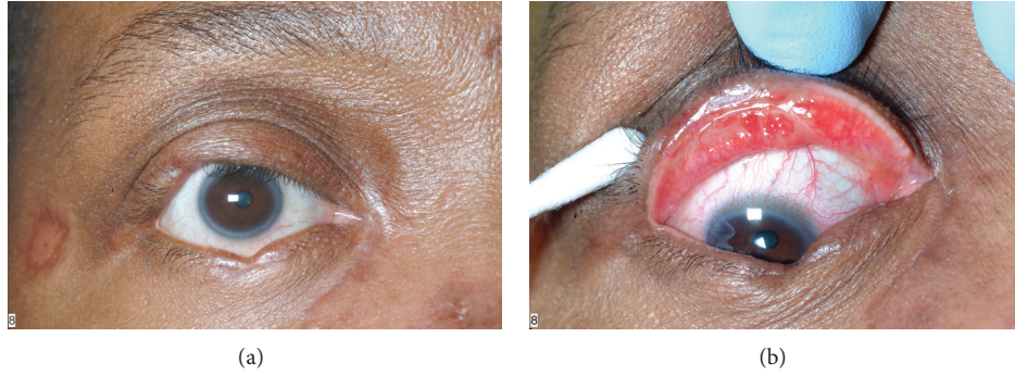
FIGURE 1: (a) Preoperative photograph of the patient showing eyelid notching, entropion, and trichiasis. Multiple sarcoid nodules on the face are present. (b) Preoperative photograph of everted right upper eyelid showing focal trichiasis, cicatricial entropion, and thickened hyperemic conjunctival scarring. Inspissated meibomian glands are seen in the medial third of the eyelid. There is grossly apparent loss of the meibomian glands in the lateral two thirds of the eyelid.