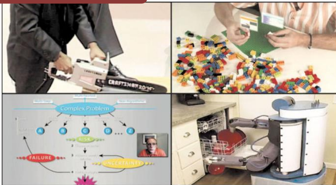
Clockwise, from top left: an online course in circuits and electronics with an M.I.T. professor (edX); statistics, Stanford (Udacity); machine learning, Stanford (Coursera); organic chemistry, University of Illinois, Urbana (Coursera).