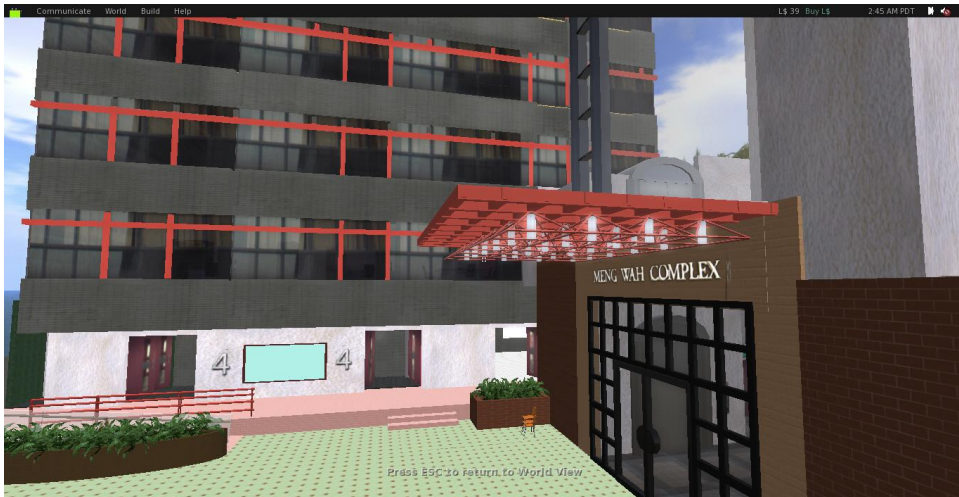
Fig. 2. Virtual campus set up in Second Life