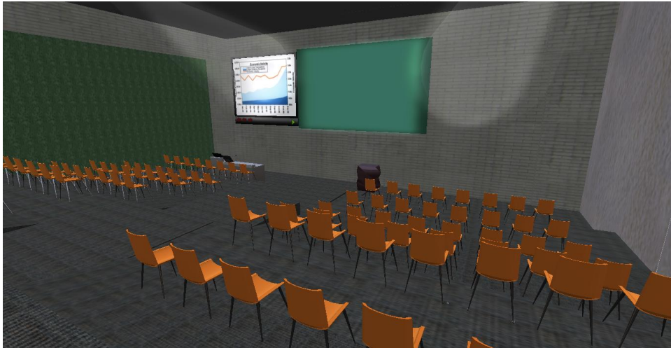
Fig. 1. Virtual classroom set up in Second Life

Eighty-two complete responses were received and the data were analyzed. Two-tailed t-tests were conducted to see whether there was significant difference in the measures between the virtual world learning environment and the traditional learning environment.