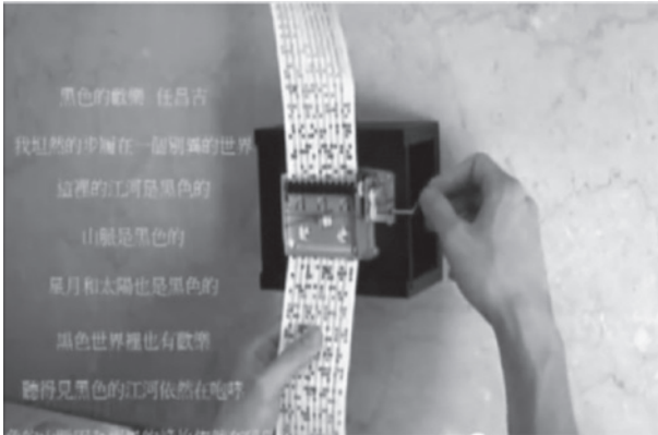
Fig. 4: The wheeling of the music card through a hand-made music box. Notice the Chinese poem scrolling along the left side of the screen, which serves as the parallel (source) text to the “translated” musical performance.

made music box, producing irregular sounds that are, at least theoretically, the aural version of the printed texts (Figure 4).