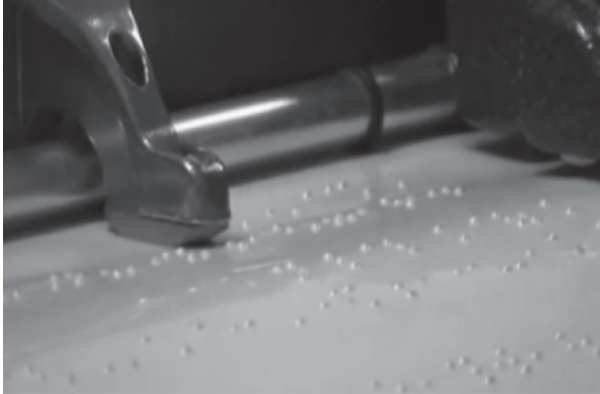
Fig. 2: The transposition of printed words into Braille.

friends, Shen experimented with the idea of transposing printed texts into the Braille code, thus enacting an intersemiotic transcreation from the verbal to the tactile (Figure 2).