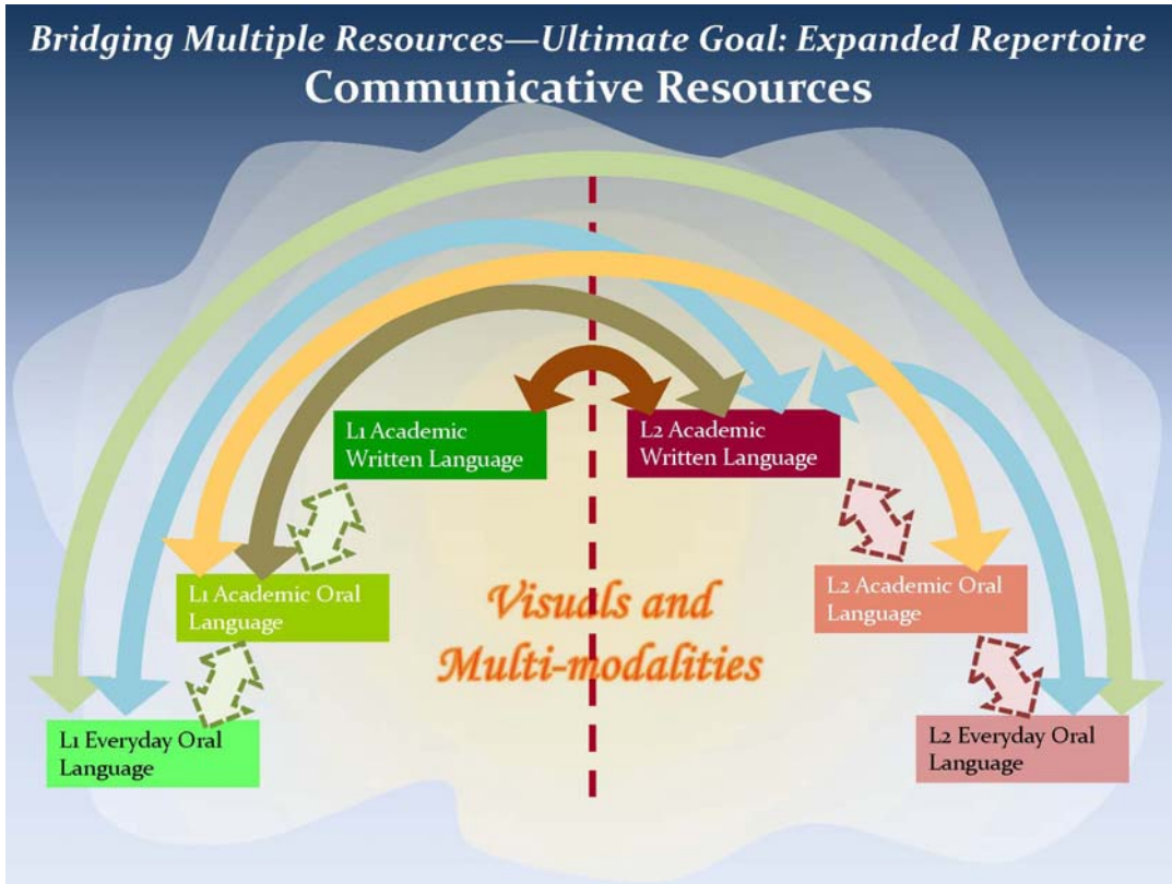
Fig. 2. Bridging Multiple Resources -- Ultimate Goal: Expanded Repertoire (From Lin, 2012, p. 93)