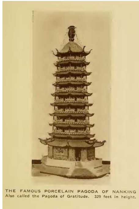
Figure 3. "The Famous Porcelain Pagoda of Nanking, Also Called the Pagoda of Gratitude. 329 feet in height." D. J. Kavanagh, S. J., 1915.

In an echo of Abeel fifty years later, figure 4, from the front page of Harper's Weekly , displays one of these Pearl River pagodas as a moldering ruin two decades after the Second Opium War (1856–60). Contrary to the caption's assertion, this pagoda is not the "oldest in the world" although it might seem so if one focuses solely on the area of the Pearl River Delta. For Harper's Magazine , China is a desolate landscape of a stagnant empire whose inhabitants are too indolent or weak to tend the land. In a forlorn and melancholic landscape scene, the monumental ruin blends into an encroaching wilderness that shadows the inscrutable inhabitants. The inset (upper left) of the imperial palace in Beijing indicates that the focal point for diplomatic standoffs between China and the West had shifted to the north and away from the southern city of Canton. Perhaps readers of Harper's Magazine read in this ruined pagoda not only the fall of the Middle Kingdom but also the countervailing rise of the United States.