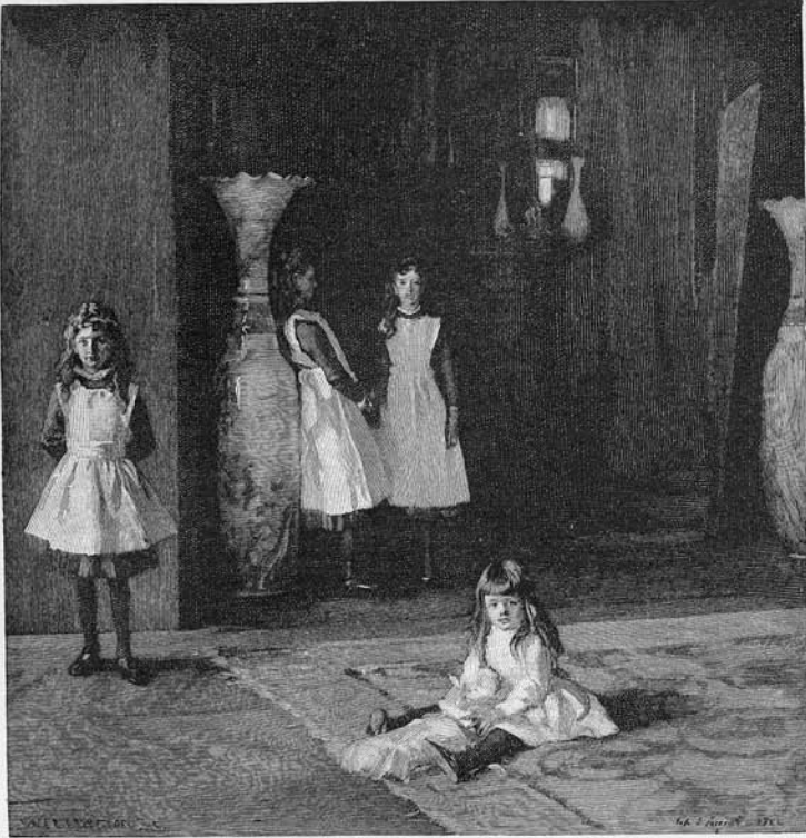
"THE HALL OF THE FOUR CHILDREN."—From the painting by John S. Sargent.

tertaining little annual exhibition of the "Mirlitons," in the Place Vendôme. With the exquisite modelling of its face (no one better than Mr. Sargent understands the beauty that resides in exceeding fineness), this head remains in my mind as a masterly rendering of the look of experience—such experience as may be attributed to a woman slightly faded and eminently sensitive and distinguished. Subject and treatment in this valuable piece are of an equal interest, and in the latter there is an element of positive sympathy which is not always in a high degree the sign of Mr. Sargent's work.