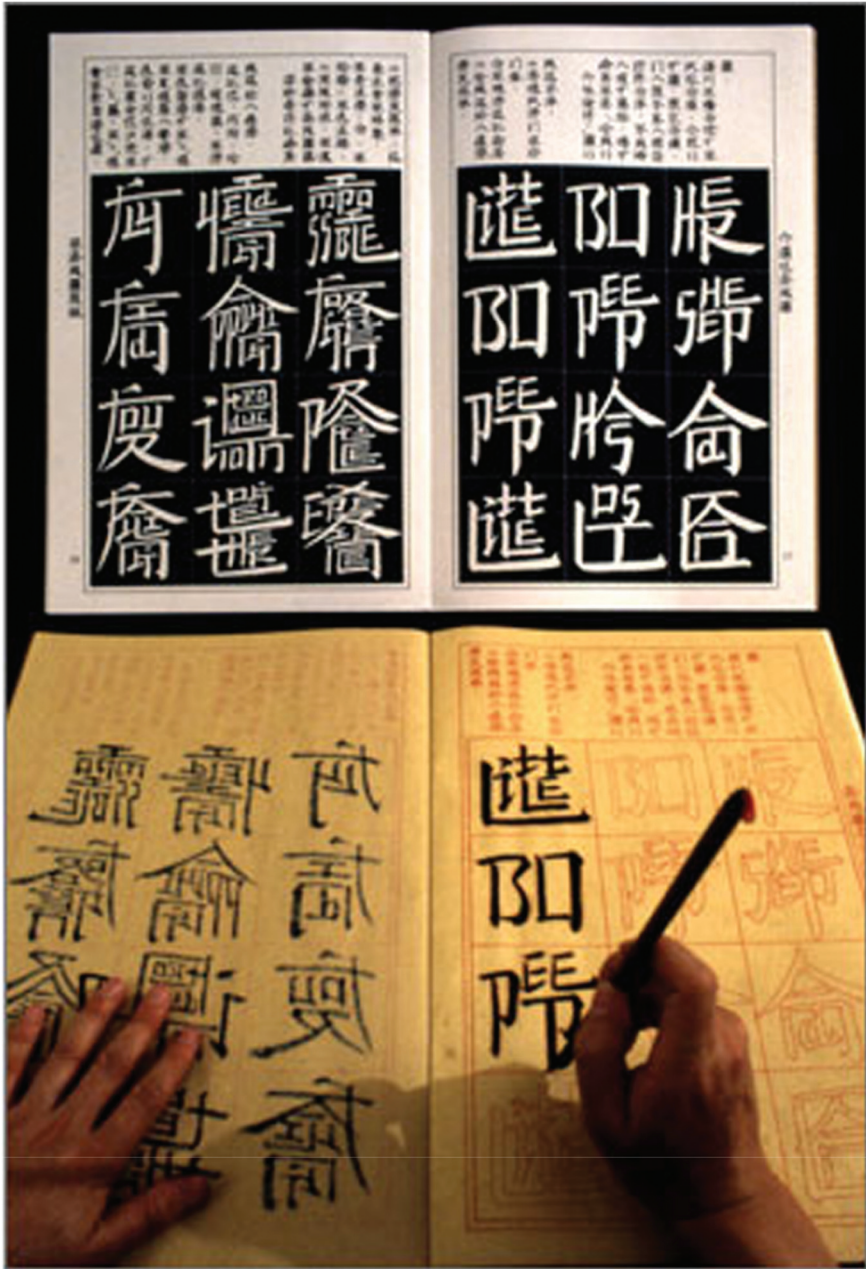
Figure 3: Instruction manual (top) and tracing book (bottom) for the classroom installation of Square Word Calligraphy .