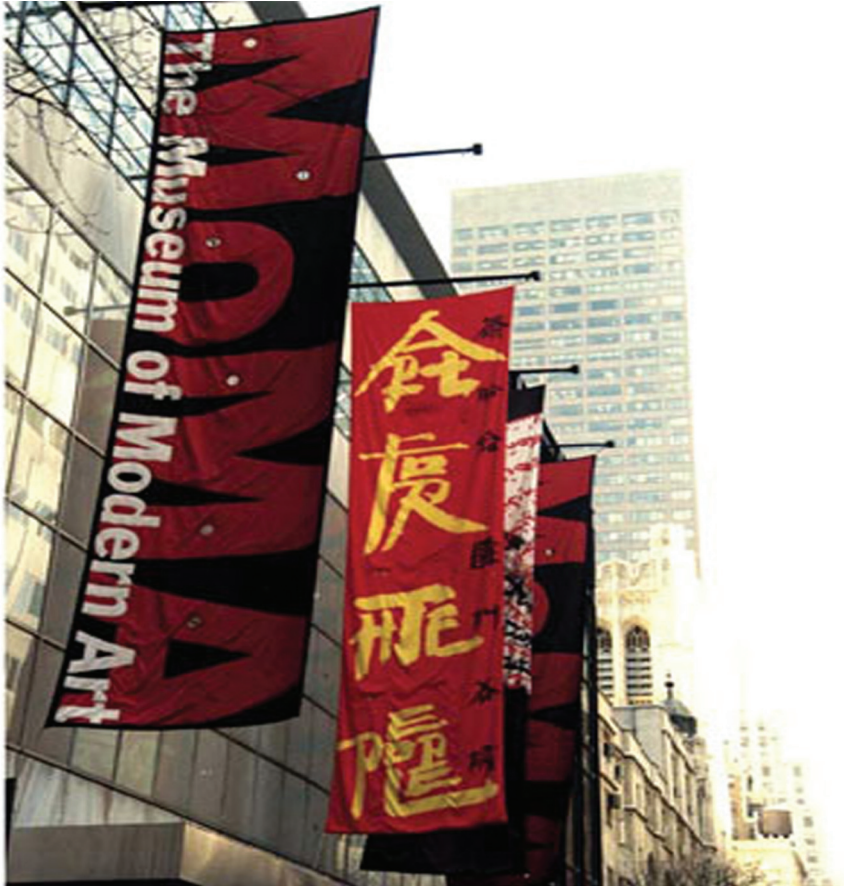
Figure 1: Square Word Calligraphy, MoMA, 1999.

characters. On closer inspection, however, these “characters” turn out to be undecipherable to the Chinese viewer: they are apparently Chinese but ultimately not recognisable as such. The greater irony is that upon scrutiny they turn out to be recognisable to the English viewer; they read, albeit in a highly defamiliarised visual: Art for the People.