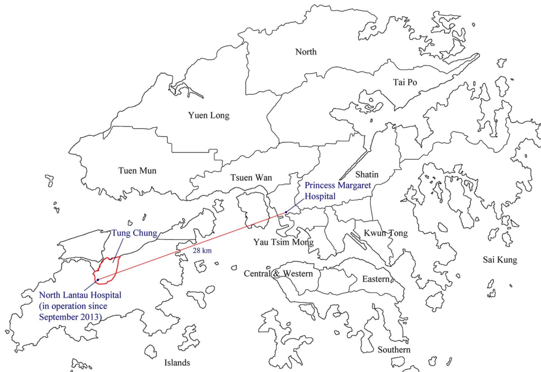
Figure 1 Map of Hong Kong showing the location of Tung Chung and location of available healthcare services for Tung Chung residents. According to the 2011 census, around 78 000 residents were living in Tung Chung new town. To satisfy the shelter demands, three public housing estates, Fu Tung Estate, Yat Tung (I) Estate and Yat Tung (II) Estate, have been established to provide more than 13 000 residential units to Tung Chung residents. However, since it is located on the north-western coast of Lantau Island in Hong Kong, a minimum of 45 minutes travelling time using the Mass Transit Railway (MTR) metro system is required for residents to travel to Hong Kong's business centre in Central, other commercial centres or the nearest regional hospital with full medical services (the Princess Margaret Hospital). (The map was drawn using the software R V.3.1.1.).

recruited from various Hong Kong subdistricts for comparison. Control families will not be invited to join our Health Empowerment Programme; nevertheless, a comprehensive health assessment will be provided at the beginning and end of the programme for collecting various health variables.