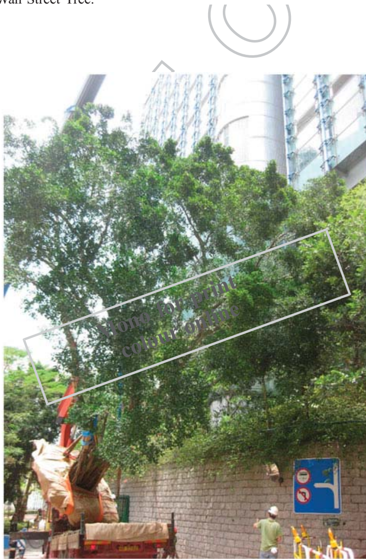
Figure 4. HKU Tree.