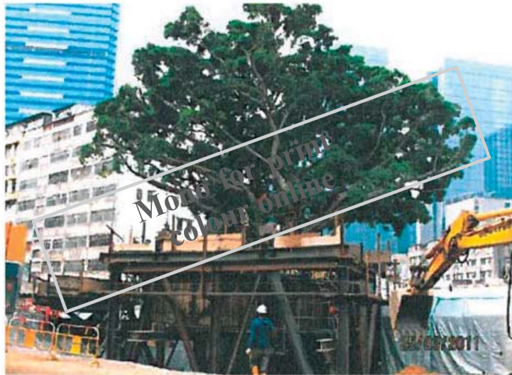
Figure 3. Yuet Wah Street Tree.