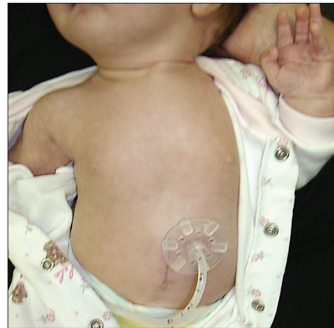
Figure 2: Gastrostomy with percutaneous endoscopic gastrostomy