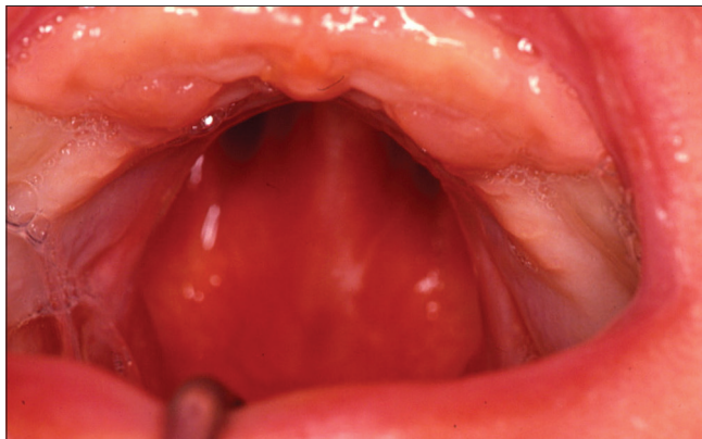
Figure 3: Hard palate width before soft palate repair