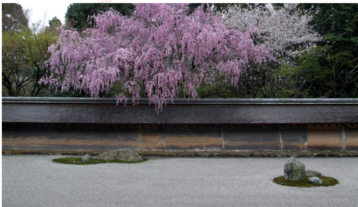
Figure 1: Ryoanji Temple, Kyoto

Queen Elizabeth of the United Kingdom visited a garden in her 1975 Japan tour. That was Ryoanji Temple (Figure 1) in Kyoto built in 1450. The garden is a rectangle of 248 square meters. Fifteen stones of different sizes were carefully composed in five groups: one group of three stones, two groups of three and two groups of two stones. These are laid on a ground of white gravel, neatly ploughed by the monks each day. The only green plants in the garden is some moss around the stones. This is considered as one of the finest examples of Karesansui – dry landscape with its three basic elements of gravel, stones and moss.