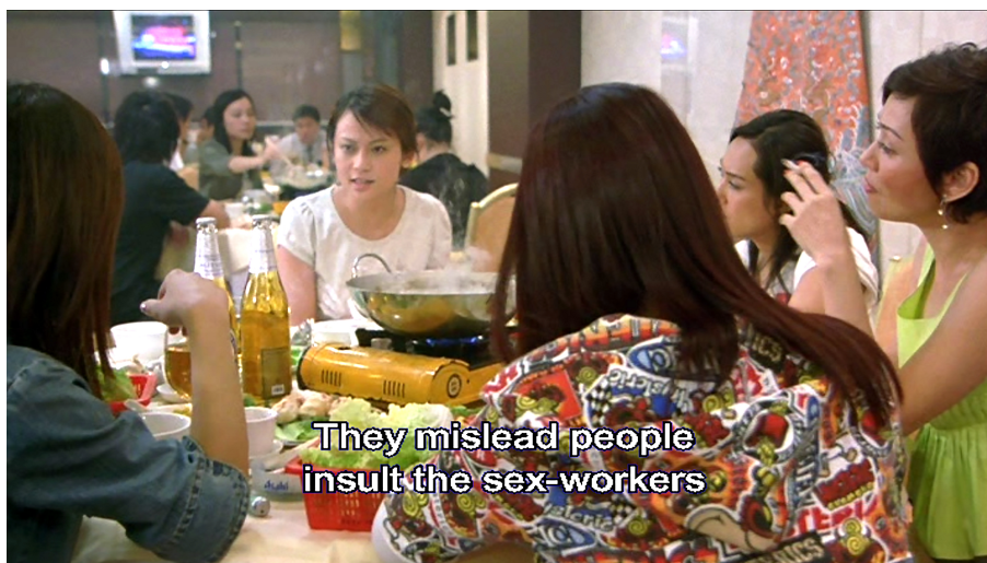
Figure 2: Elsie continues her campaign in a restaurant in Whispers and Moans . Mei Ah Entertainment, 2007. Screenshot.

Elsie intervenes to “raise the consciousness” of these prostitutes as women as well as workers (Figure 1). Her campaign parallels some of the actual efforts of the Hong Kong sex worker advocacy group, Zi Teng, meaning “purple vine”. This group has produced its own film about the sex trade in Hong Kong, Sisters and Ziteng (King-chu Kong, 姐妹妹妹與紫藤, 2006), which deals with many of the same issues exposed in Chan and Yau’s film. Like comparable organisations elsewhere, Zi Teng has several goals including educating the general public about sex work as well as being “actively engaged in building contacts with sex workers, providing them information on health care services, their legal rights and other resources” (“About Us”). Elsie introduces the work of her fictitious organisation to a group of sex workers eating in a local hotpot restaurant as follows (Figure 2):