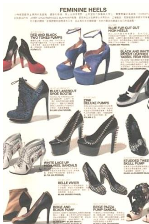
Figure 2. Example of Kris’s product styling. Red-lacquered soles of Christian Louboutin and other branded high heels.