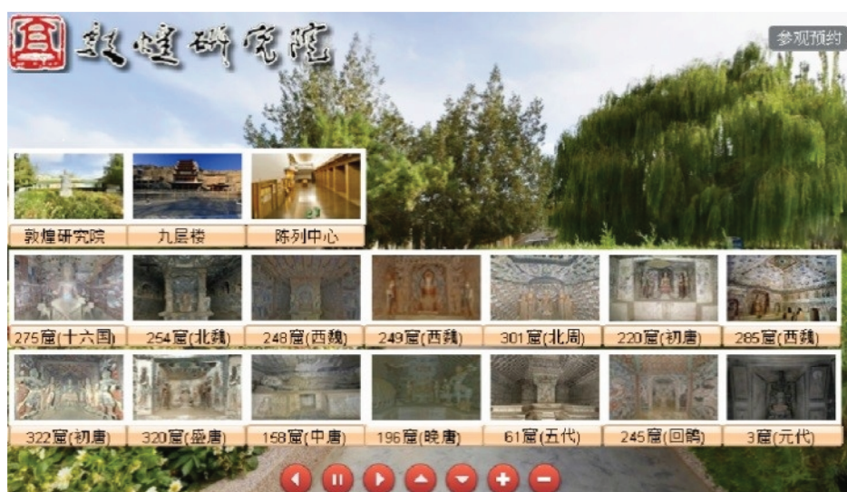
Figure 1. Homepage of the Mogao Cave Panorama DL ® of Dunhuang Research Academy.

17 scenes: the surroundings of the academy, the exhibition center outside the Grottoes, and 14 caves. The caves were reconstructed in 360-degree panoramic views to support users' seamless explorations (Kenderdine, 2013). Users can control the views and navigate through the DL using mouse clicks and movements. Most of the scenes can be zoomed in and out for flexible examinations in different resolutions. Users are also allowed to navigate through the caves by following several prepared paths, which are highlighted as "green footsteps" in the photos. The scenes also have audio introductions in Mandarin Chinese. Figure 1 shows a screenshot of the homepage of the DL.