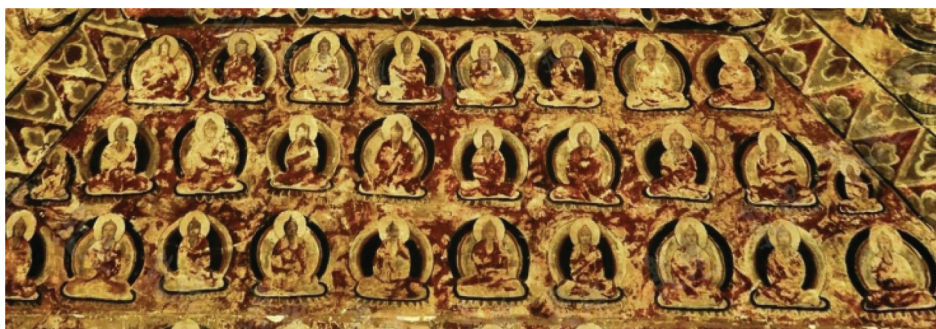
Figure 3. Example of Thousand-Buddha motif ® of Dunhuang Research Academy.

Tasks 6 to 8 are judgment tasks that require the participants to first locate needed information and then formulate an opinion based on analysis of the information: