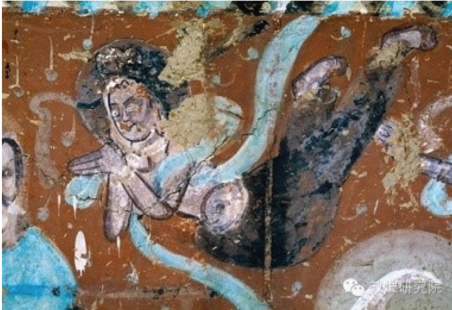
Figure 4. Example of Flying Apsaras © of Dunhuang Research Academy.

Effectiveness of the DL in supporting information seeking was measured by the proportion of tasks that were successfully completed © (i.e. task success rate).