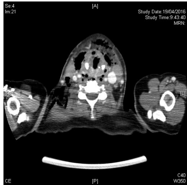
Figure 1: Extensive involvement to all deep neck spaces.

Candidaemia is by far the most frequent clinical syndrome of invasive candidiasis. It can be associated with deep tissue infection, such as intra-abdominal candidiasis, candida endocarditis, ocular candidiasis and candida meningitis. The gold