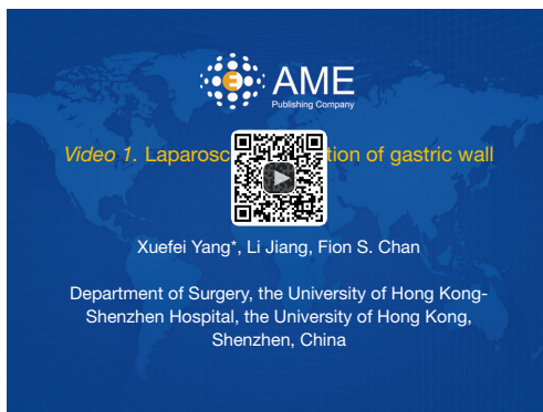
Figure 2 Laparoscopic resection of gastric wall tumor (11). Available online: http://www.asvide.com/articles/1034

separated. The chief surgeon stood between the legs. The assistant stood on the left side and the camera operator stood on the right side of the patient. A 10-mm trocar was placed in subumbilical region and pneumoperitoneum was created. The intra-abdominal pressure was maintained at 12 mmHg. The other trocar sites including a 12-mm trocar at right upper quadrant mid-clavicular line, two 5-mm trocars at left upper quadrant mid-clavicular line and anterior axillary line are shown in Figure 1 .