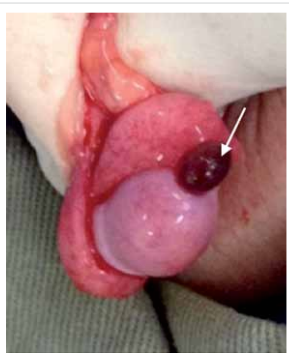
FIG 4. Torsion and testicular appendage Torsion of a testicular appendix (hydatid of Morgagni) is shown (arrow)

Varicocoele is an abnormal venous dilatation and/